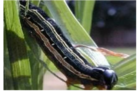
Spodoptera spp

The local chapter of the national society along with National DM Coordinator carried out a preliminary assessment of the situation. Based on the report of the assessment, the Red Cross has rehabilitated one hand pump and constructed another in Larwei, one of the affected communities with a total population of 1,650 inhabitants. The Liberian Red Cross Society (LRCS) has also distributed 537 pieces to the same number of families in five most affected communities of Larwei, Kolonta, Denyea, Malangai and Shankpallai covering a total population of 7,443 persons. The National Headquarters has also prepositioned 150 bottles of (0.5 liter per bottle) of household chlorax at the local chapter for household chlorination exercise during the week. As the Red Cross mobilized and deployed its team of volunteers to carry out health and hygiene promotion sensitization activities in the 5 most affected communities in the district, the national society is also working in close collaboration with the Ministry of Health through the County Health Team. They will be conducting initial assessment and develop a common plan of response action. These activities are being carried out to prevent outbreak of diseases such as cholera, diarrhea and malaria.