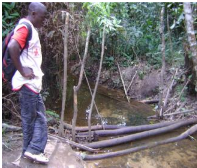
Contaminated water source/LRCS

Caterpillar insects invaded some communities in the Zota District of Bong County, Central Liberia, affecting a total of 8,223 persons. The insects have destroyed farm lands with potential food security risk and outbreak of water related diseases. The Liberian Red Cross Society (LRCS) in collaboration with other partners including government has intervened to reduce the impact of the disaster. The national society has carried out an assessment of the situation, distributed and repaired hand pumps to prevent outbreak of water related epidemics. The volunteers are also carrying out health and hygiene sensitization activities in the affected communities. Government and other partners have also been spraying the affected communities. The national society hopes to intensify its intervention activities working in close collaboration with government agencies and other partners.