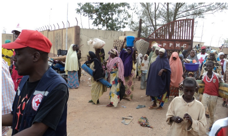
NRCS volunteers assisting displaced population in Kaduna/NRCS

Summary: Violent protests in the northern part of Nigeria following the 16 April 2011 presidential poll have led to the death of hundreds of people with thousands injured while property including buildings and vehicles were damaged. Thousands of