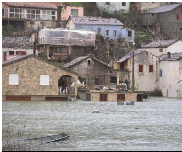
Vranjina, Golubovci, December 2010.

Summary: Heavy rains over almost a month caused floods all over Montenegro. Eleven municipalities are seriously affected at the moment: Ulcinj, Bar, Cetinje, Golubovci, Tuzi, Danilovgrad, Nikšić, Kolasin, Andrijevica, Berane and Plav. In total 6630 persons (1600 families) have evacuated from their houses in these municipalities. The Red Cross of Montenegro distributed all of its emergency stock to the affected population and put its logistics department at the disposal of all stakeholders who participate in evacuation and response to the situation.