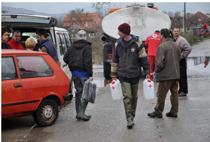
Water distribution in Golubovci.

The abovementioned operation, however exhausted the emergency stock of the Red Cross of Montenegro and even with this stock partially being replenished from DREF funds, the needs produced by the new floodwave demand additional procurement. The needs identified through assessment in relation to the newest flood do not overlap with the needs identified in the previous operation and subsequently the two operations are to be seen as independent and the national society needs all the requested funds as described in the attached budget to successfully respond to the new situation.