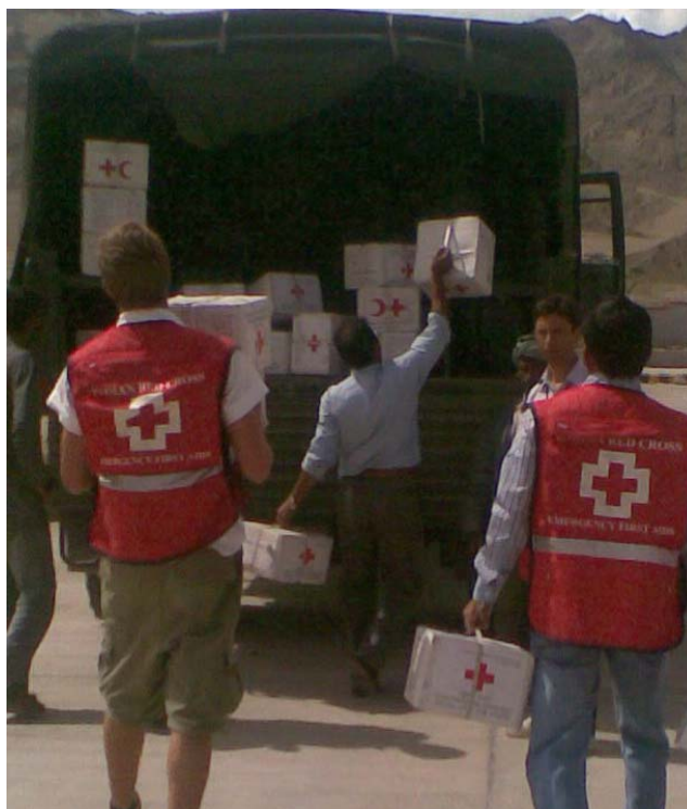
Volunteers loading relief items in the truck.

In order supplement the efforts of the central and state governments, the Indian Red Cross Society (IRCS) has decided to extend non-food items support up to 25,000 beneficiaries (5,000 families). The state and district branches are already in the field and are extending all possible support to the affected population. IRCS national headquarters will also reinforce the capacities of the state branches with the deployment of national disaster response teams (NDRT). The NDRT members will assist the state and district branches in a joint assessment with the International Federation of Red Cross and Red Crescent Society (IFRC), distribution planning and logistics. The DREF funds will be used to replenish the non-