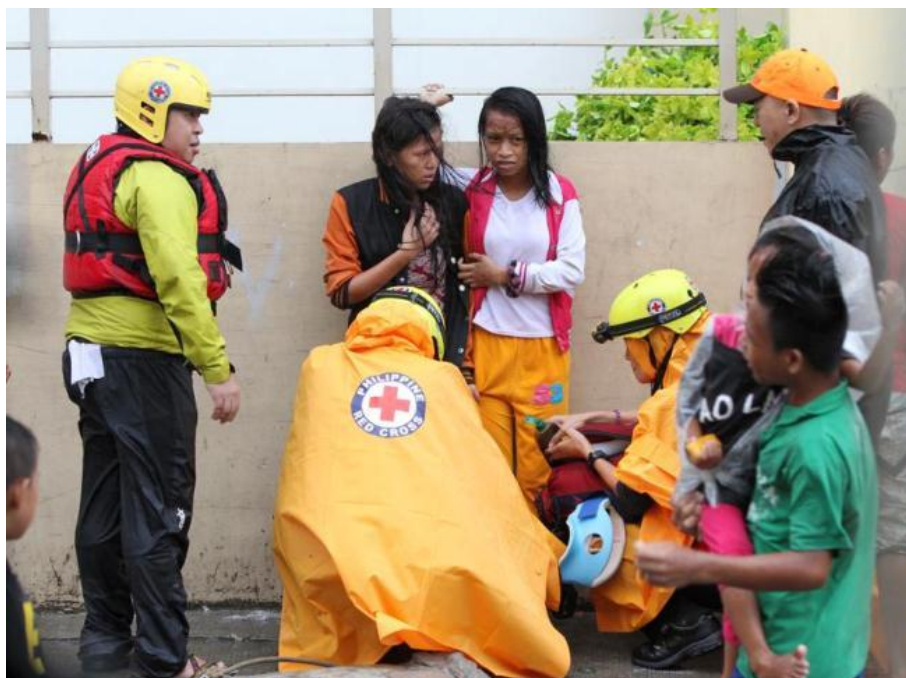
After the typhoon: A Philippine Red Cross (PRC) emergency response unit (ERU) assisted in the evacuation and rescue of affected families in Baseco Compound, Manila. Medical teams also administered first aid to evacuees with minor injuries.

According to the National Disaster Risk Reduction and Management Council (NDRRMC), as of 17 July, some 882,300 people have been affected in the Ilocos region, Central and Southern Luzon, the Bicol Region and Eastern Visayas. Forty fatalities have been reported while some 530,000 people are currently being housed in