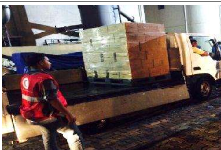
Maldivian Red Crescent volunteers assisting the Maldivian Defence Force and Police in water distribution.

At the time of publishing this report, government of India extended its support to Maldives. The water supplies are expected to reach Male' by air or ship around the evening on Friday, 5 December 2014. As of 4 December midnight when the distribution points were closed, 90,000 people were provided with 2-litre of water each. These included locals and expats with ID cards and proper documentation (work permits and entry stamps). The distribution of water started on 5 December at 08:30 hr. The MNDF is replenishing water from the nearby water desalination plants located at Thulusdhoo island, which is located at least two hours from Male'.