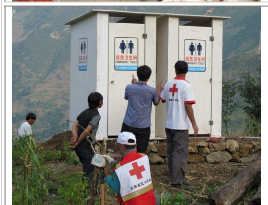
Below: Yunnan ERT members setting up sanitary latrines at the evacuation point.

Yunnan Earthquakes – Yunnan province alone had been hit by two earthquakes in 2012.