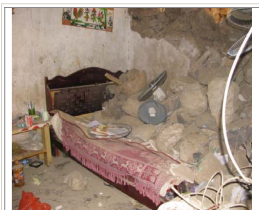
Above: A house was badly damaged by rolling rocks caused by the earthquake.

Besides relief items, Beijing Red Cross teams continued to offer support and comfort to shocked survivors and searched for those possibly still trapped in the water. A Beijing Red Cross 999 Emergency Response team was sent to Fangshan area to rescue people trapped by the floods and help care for some of the more than 65,000 people evacuated from their homes. Hundreds of ambulance crew members and volunteers were involved in the relief operations. The specialized Beijing Red Cross Blue Sky Rescue Team was also sent to search and rescue flood-affected people, and over 200 affected people were rescued by this team.