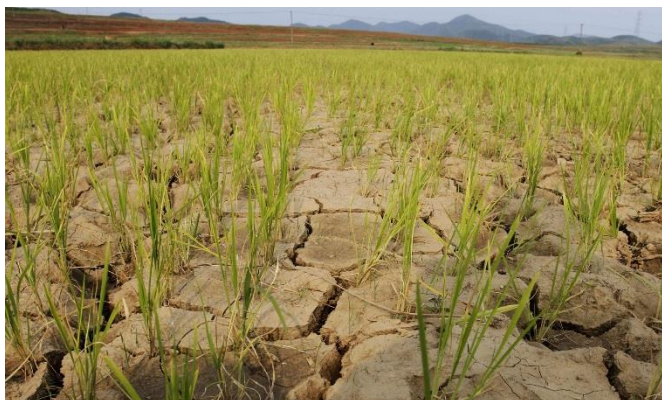
Temperatures have reached more than 40°C in some regions of North Korea since late July.

The IASC Index for Risk Management (INFORM) ranks DPRK 41 out of 191 countries in terms of disaster risk. Floods and drought, sometimes both in the same year, regularly strike the country. An estimated 6.2 million people have been affected by natural disasters between 2004 and 2016. Furthermore, climate change has produced, and is expected to produce further visible impacts, with the degradation of natural resources affecting agricultural production.