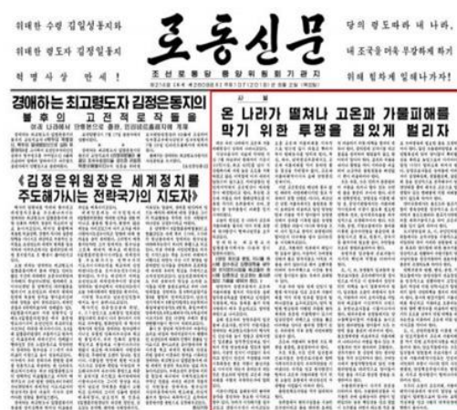
State media column on the heat wave

Initial reports of crop damage from South Pyongan and South Hamgyong from the local Red Cross branches indicate the following situation: