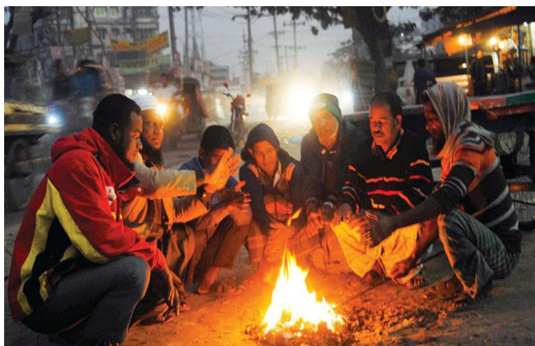
People light a fire and gather around it for warmth in Hasnabad area of the capital as moderate to severe cold wave sweeps the country.

The cold wave has disrupted the lives of many in northern Bangladesh. Poor people, particularly the farmers and rickshaw-pullers, have been affected badly. Children and elderly people are the worst affected. Twenty-seven (27)