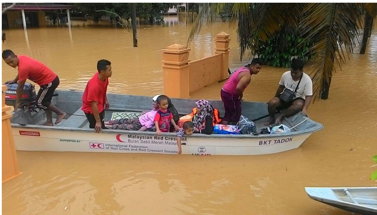
MRC Terengganu helping evacuees in Kampung Tadok

The seasonal heavy continuous rains in the East Coast of Malaysia from 26 th December 2016 have caused flooding in two states, namely, Kelantan and Terengganu. The floods have temporarily displaced about 25,000 people and have rendered some villages inaccessible due to damaged bridges and blocked roads. Public facilities including health centres and schools were also inundated. Schools were cancelled in many of the districts as they were converted into evacuation centres.