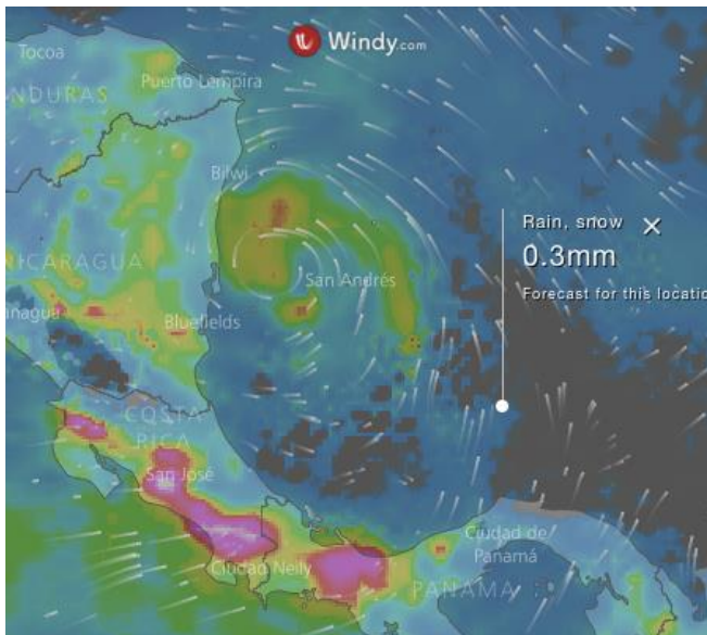
Map 1 Rain

As Tropical storm warning is in effect for Sandy Bay Sirpi Nicaragua to Punta Castilla in Honduras. Other possible areas to monitor are the Bay Islands in Honduras, western Cuba and the Yucatan Peninsula