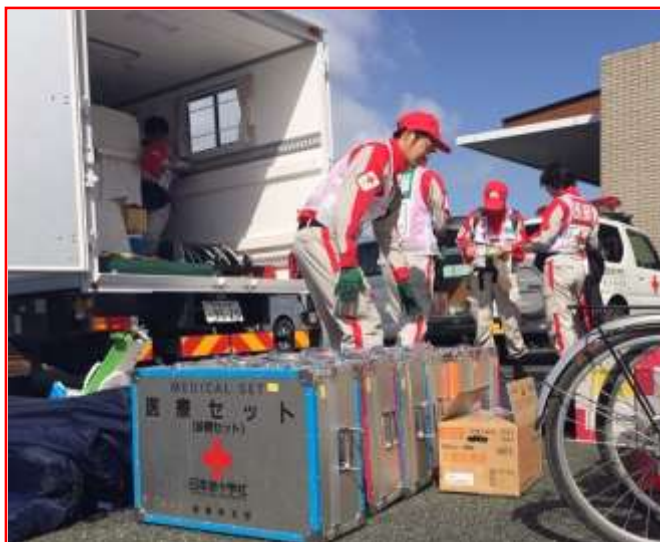
(Top) JRCS mobilized its emergency teams to provide medical support, distribute relief items and provide psychosocial support to affected families sheltering in evacuation centres.

Since the onset of the first quake, JRCS's Kumamoto Red Cross Hospital has received more than 2,000 injured patients for the first week and an average of 300 people daily. Medical service infrastructure in Kumamoto was severely damaged in the earthquake and the Red Cross hospital played a key role in covering the needs of people who were injured as a result of the disaster. Other Red Cross hospitals in Japan are providing support to Kumamoto to increase their capacity. A total of 50 doctors and 250 nurses will join the team at Kumamoto Red Cross Hospital in the coming weeks.