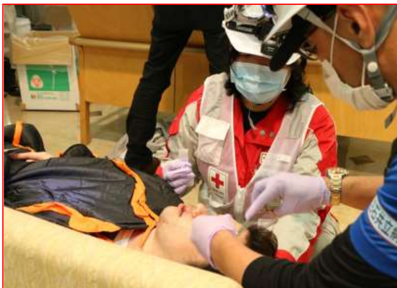
Medical staff at the Red Cross Kumamoto Hospital have been working around the clock to treat hundreds of injuries resulting from the earthquakes.

20 April: The IFRC and JRCS welcome international contribution to its humanitarian assistance for the people affected by the earthquakes. The situation continues to be uncertain with continuing strong quakes and aftershocks, storm and landslides, further damages have been reported around the evacuation centres. Some evacuees who sought shelter in these evacuation centres have been moved to other safe shelters. JRCS is monitoring the situation closely in coordination with the government and local authorities to ensure humanitarian assistance is provided timely and effectively.