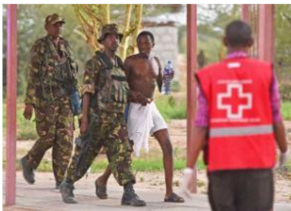
Kenya Red Cross Volunteer assists while a student is escorted out of Garissa University College after Kenya Defence Forces ended the attack by Al Shabaab gunmen.