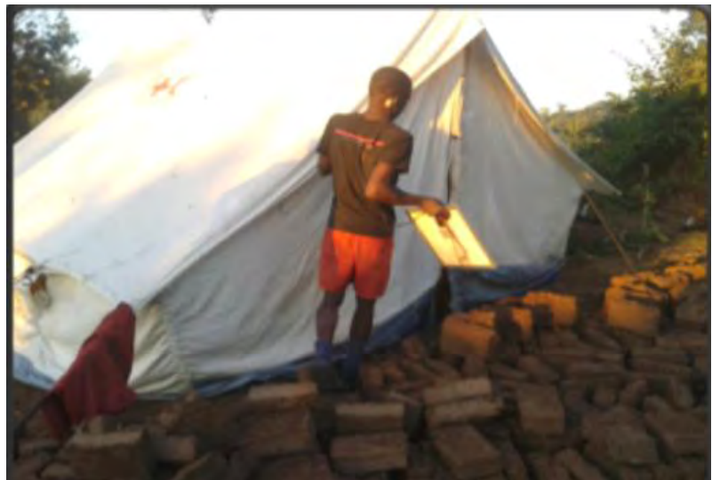
IFRC/ZRCS provided emergency shelter to communities affected by the floods in Zimbabwe.

Manicaland. Up to 125 people died in the floods and storms and an estimated 9,700 persons were affected, around half of which require urgent humanitarian assistance.