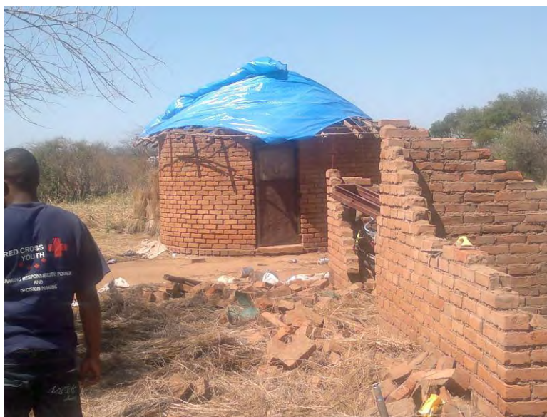
ZRCS provided immediate relief assistance to affected families whose homes were damaged in a severe hailstorm in Mberengwa.

other stakeholders such as IOM, who supported 183 of the affected families. As such, ZRCS revised its response plan accordingly to cover the remaining 100 families, resulting in a balance of stocks for 183 families undistributed. The table below provides some additional detail: