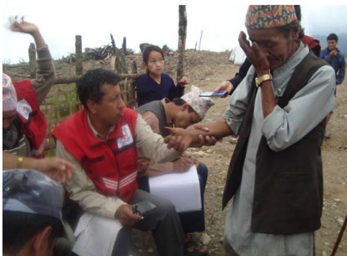
NRCS volunteers carrying out assessment in Taplejung district.

Of the total allocated DREF, CHF 66,521 has been spent. The balance of CHF 2,613 will be returned to