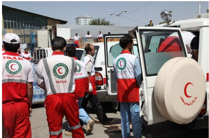
Iranian Red Crescent volunteers and staff teaming to help the most vulnerable people.