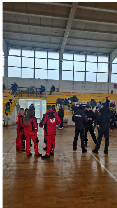
Red Cross team assisting evacuated people in Kichevo