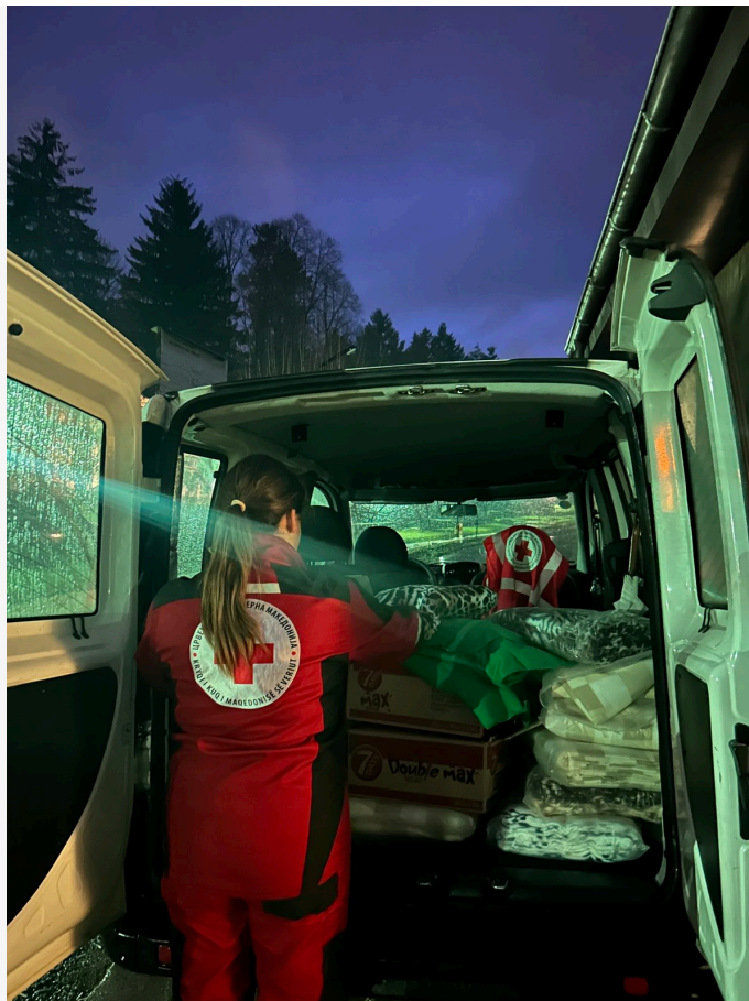
Red Cross of North Macedonia volunteer preparing support in the field.