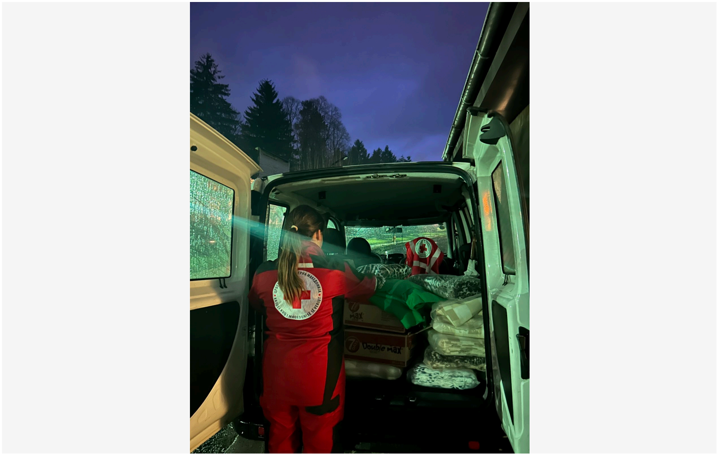
Red Cross of North Macedonia volunteer preparing support in the field.