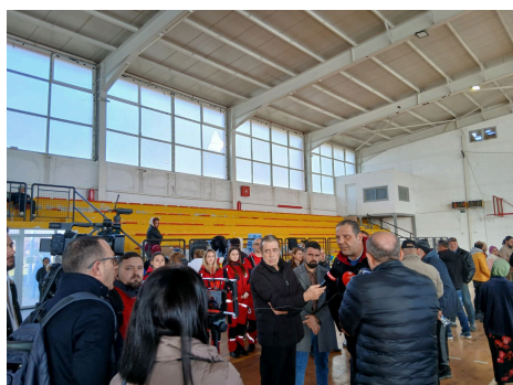
Local government officials visiting the evacuated people in Kichevo