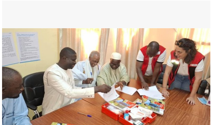
Signing the Framework Agreement with the Health Center of Rosso