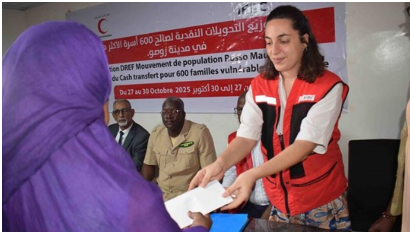
Cash distribution to vulnerable host families.