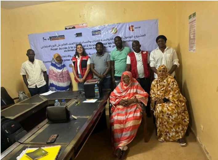
Meeting with Terre des Hommes and the Association of women head households

This escalating situation underscores the urgent need for reinforced, multi-sector humanitarian support to ensure protection, basic assistance, and dignified conditions for migrants and refugees affected by the crisis.