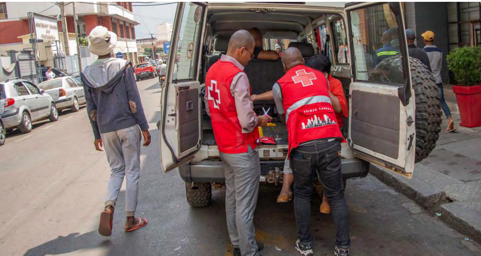
Amid ongoing election-related unrest in Madagascar, the Malagasy Red Cross Society has been providing continuous first aid support to those injured during the escalating street protests

IFRC-DREF Madagascar Cyclone Gamane : the DREF allocation of CHF 148,708 in April 2024 supported the Malagasy Red Cross Society in assisting more than 10,000 people affected by the onset of Cyclone Gamane in the area of Sava. The National Society supported the targeted people over a four-month period with assistance such as multipurpose cash assistance, WASH interventions, protection and community engagement, among others.