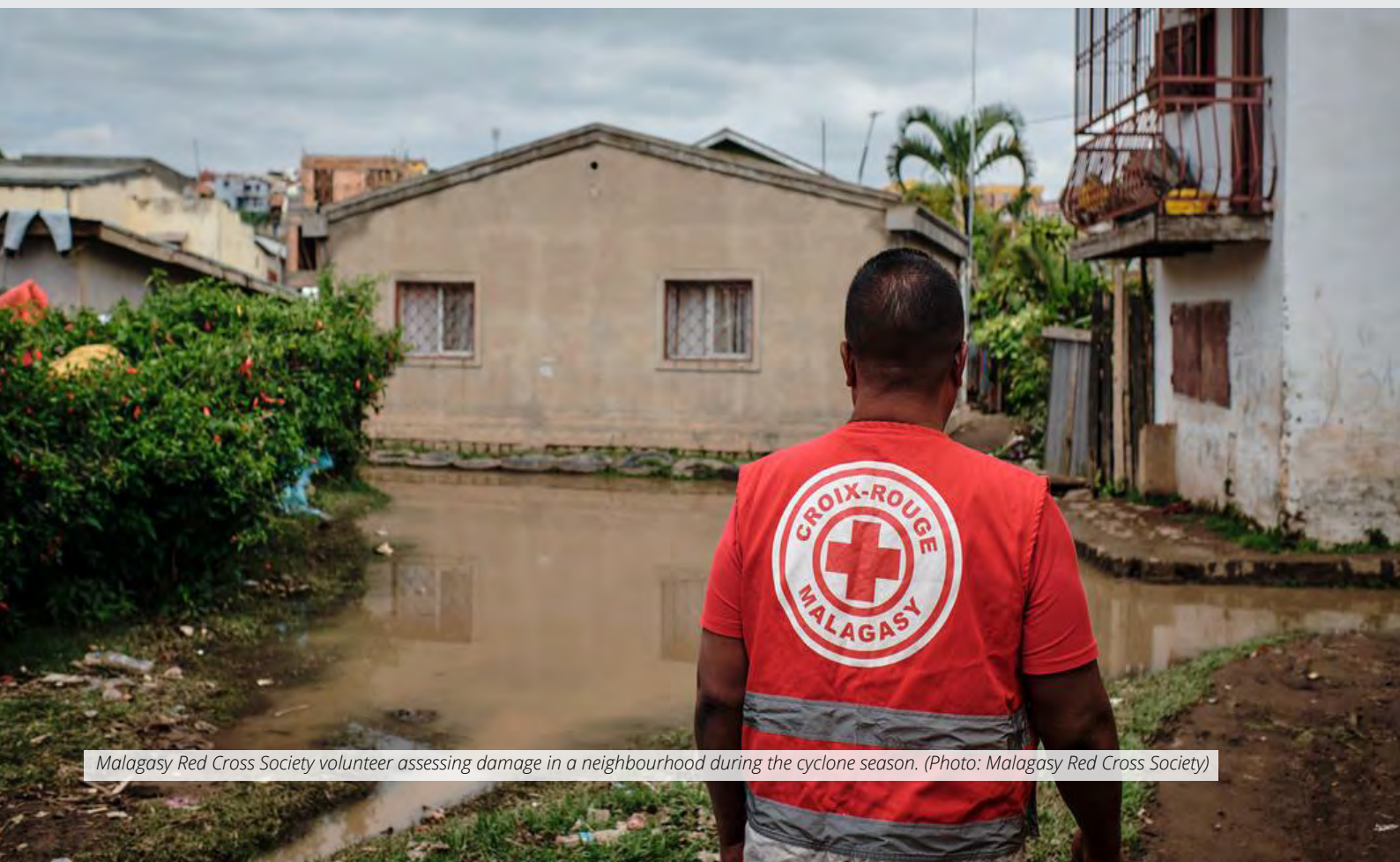
Malagasy Red Cross Society volunteer assessing damage in a neighbourhood during the cyclone season.