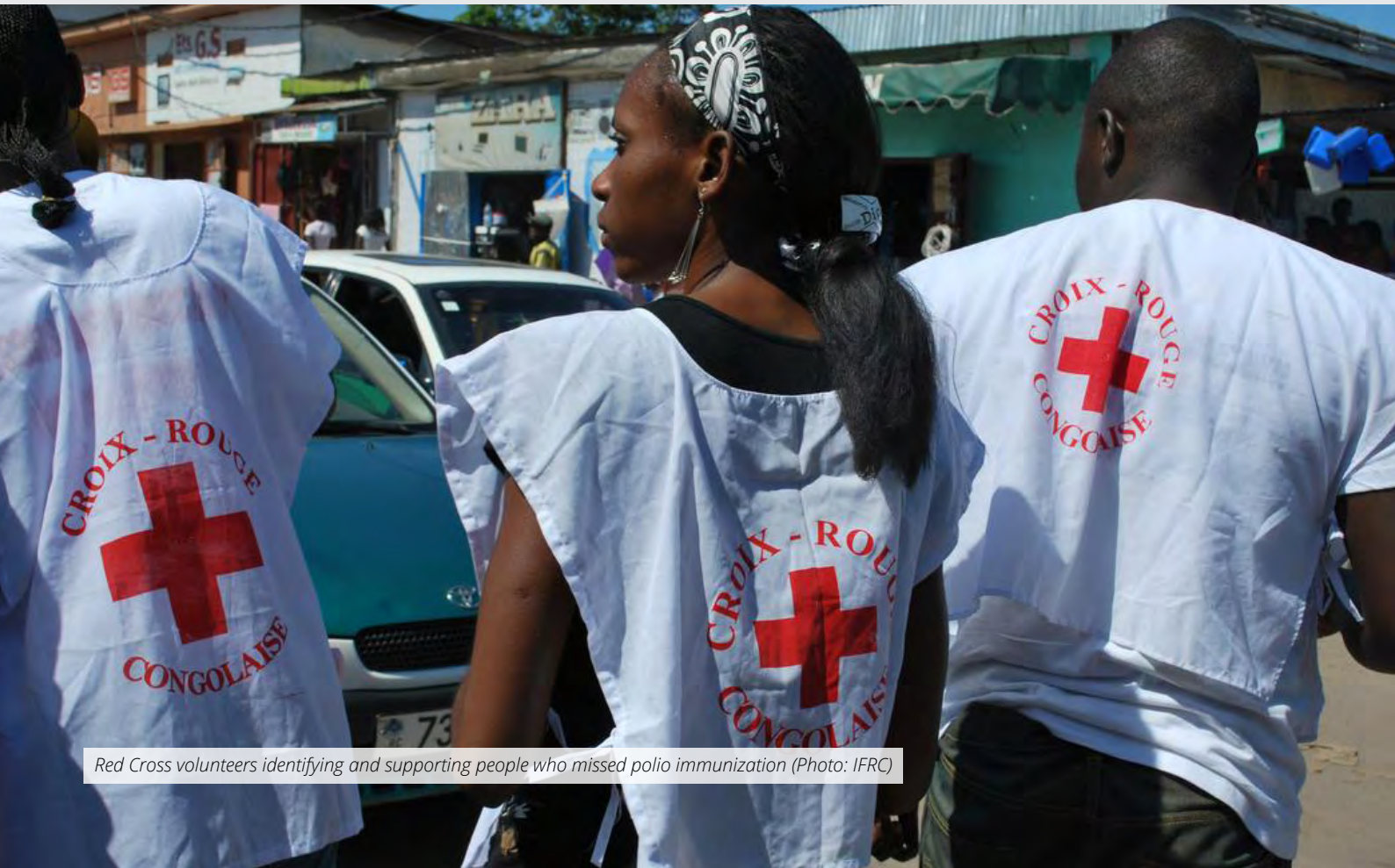
Red Cross volunteers identifying and supporting people who missed polio immunization

World Bank Population below poverty line 40.9%