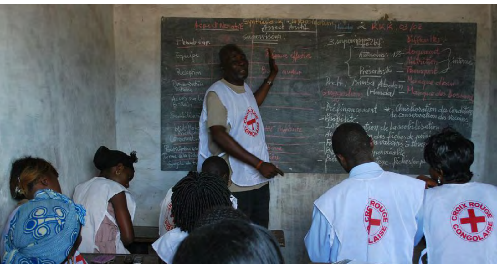
Volunteers undertake a debriefing following the first phase of polio vaccinations

The IFRC supports the Congolese Red Cross to reach more local branches and to develop an equal partnership with communities in projects and programmes implemented by the National Society. It supports the National Society to actively implement the IFRC's gender and diversity policy, developing protection from sexual exploitation and abuse (PSEA) policy, and an action plan to implement prevention and support to survivors. The IFRC will continue support the National Society to integrate and institutionalize PGI and CEA into its policies, operations and procedures.