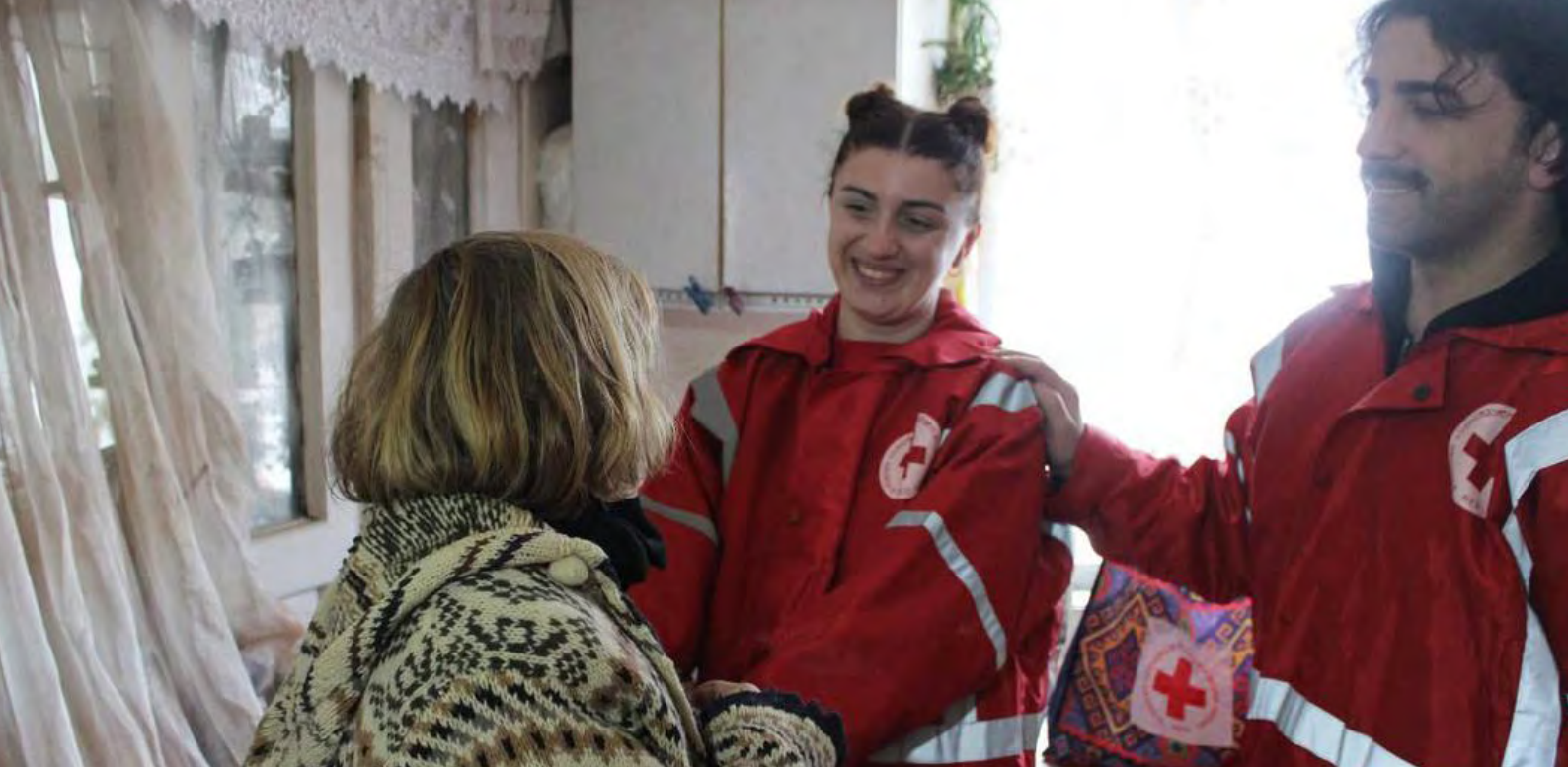
The Georgian Red Cross teams reached snowfall affected areas with relief items for those in need.