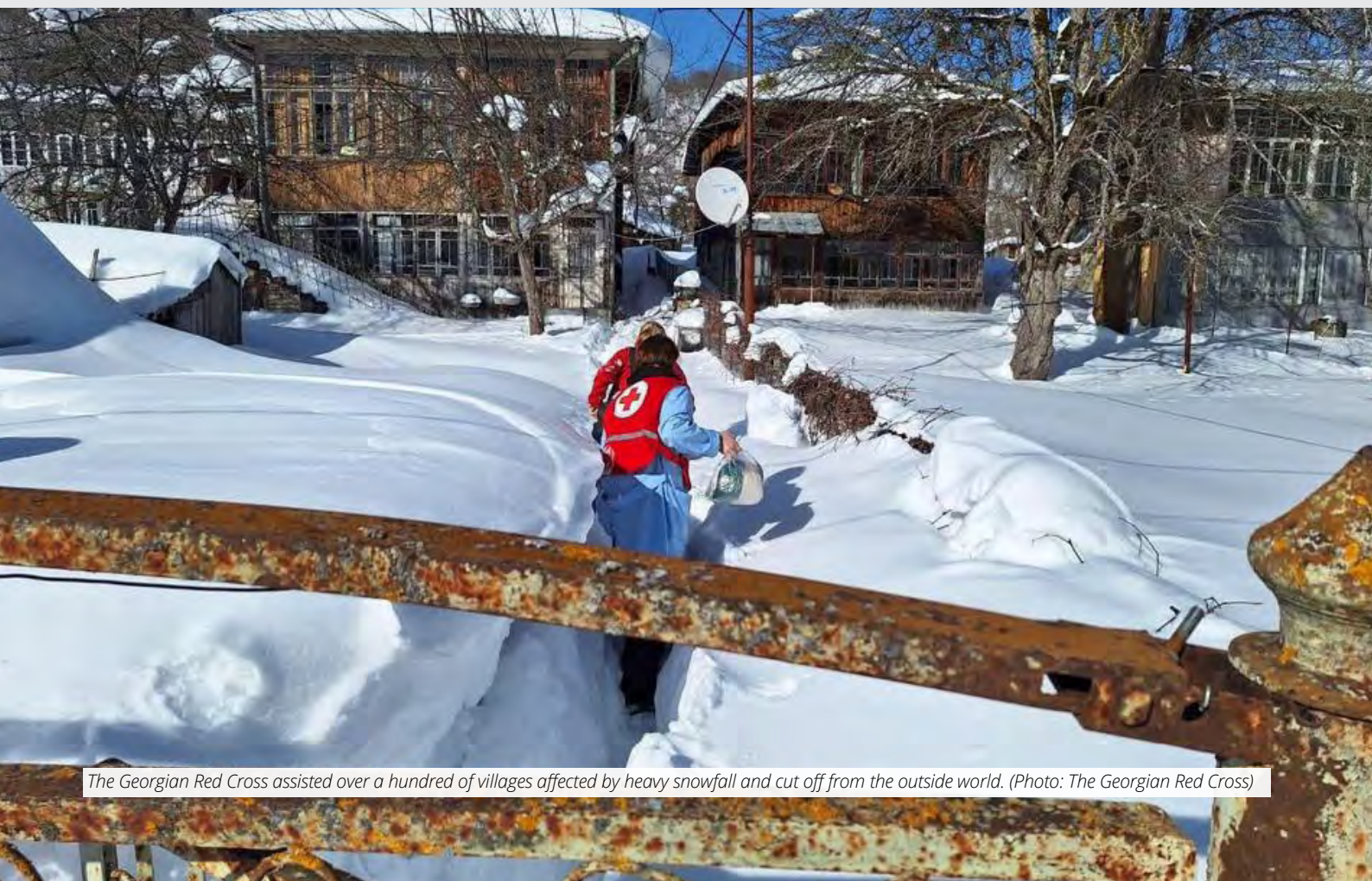
The Georgian Red Cross assisted over a hundred of villages affected by heavy snowfall and cut off from the outside world.