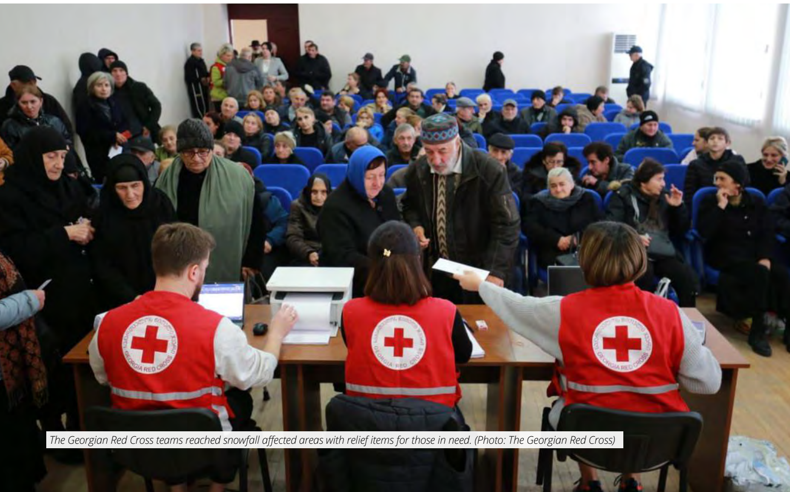
The Georgian Red Cross teams reached snowfall affected areas with relief items for those in need.

Georgia Red Cross Society through numerous Emergency Appeals and Disaster Response Emergency Fund (DREF) operations.