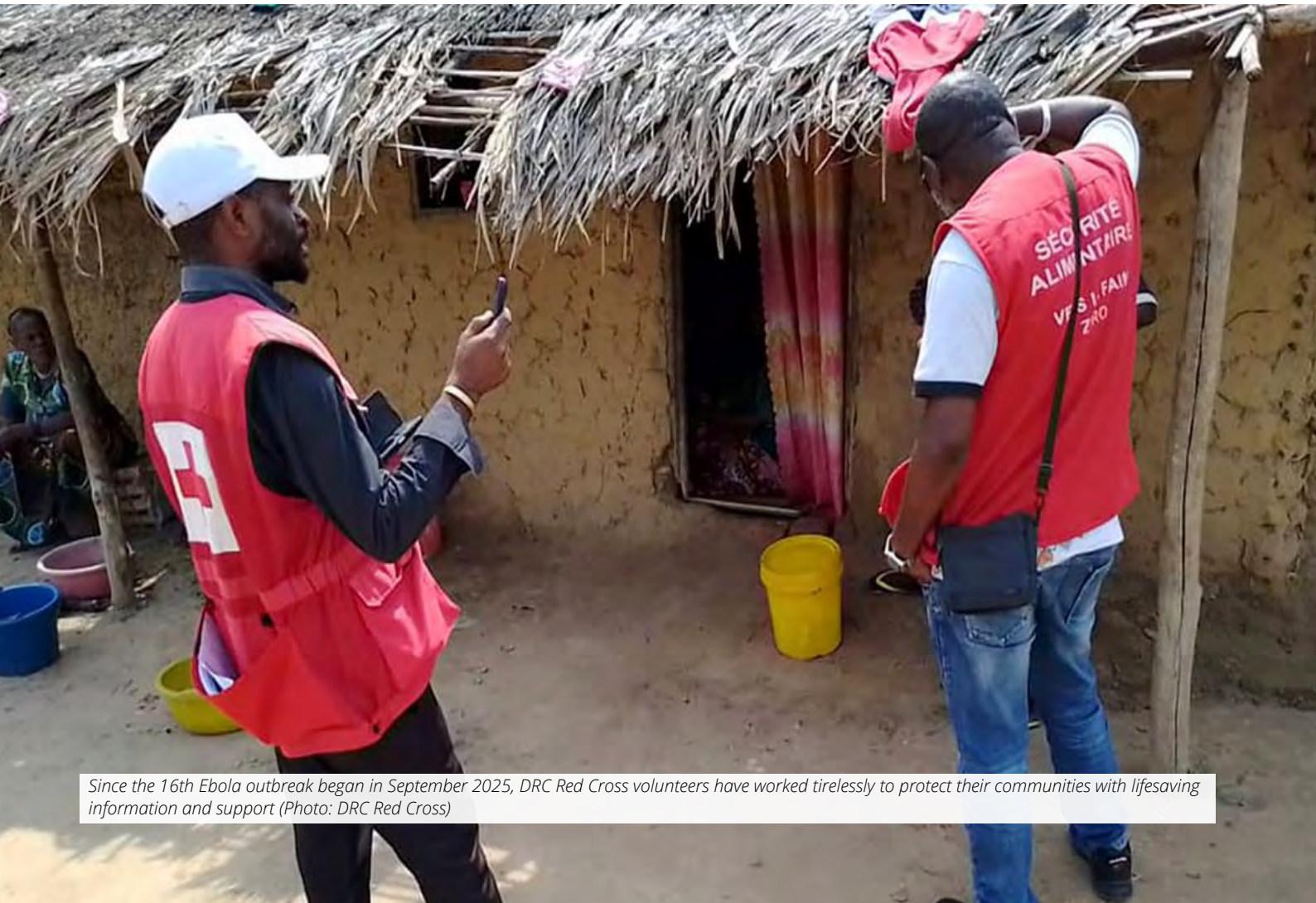
Since the 16th Ebola outbreak began in September 2025, DRC Red Cross volunteers have worked tirelessly to protect their communities with lifesaving information and support

In 2025, the operations and projects supported by the IFRC in the Democratic Republic of the Congo include the Population Movement Emergency Appeal in North and South Kivu; and the Mpox outbreak response through the Africa Region's Mpox Emergency Appeal (closed on 30 June). Additional initiatives include the DREF response to flooding in Kinshasa and Tanganyika, the Early Warning Protocol project (simplified), the Zero Famine Project in North Kivu and Tanganyika (Sécal), the CDC MasterCard SLL Project, and the Community Pandemic Preparedness Program (CP3). The DG ECHO Pilot Programmatic Partnership (PPP) also concluded on 30 June 2025. Other ongoing projects are the joint WFP-FAO-IFRC Anticipatory Action Project titled 'Disaster Preparedness: Pioneering Innovations in Flood Risk Management in the DRC' and the Maniema Immunization Support Project supported by the CDC.