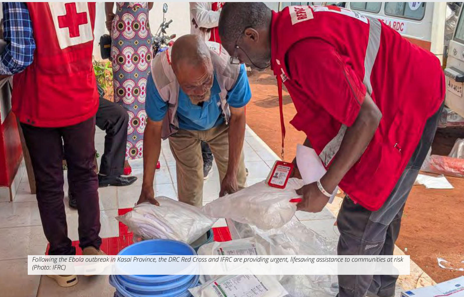
Following the Ebola outbreak in Kasai Province, the DRC Red Cross and IFRC are providing urgent, lifesaving assistance to communities at risk