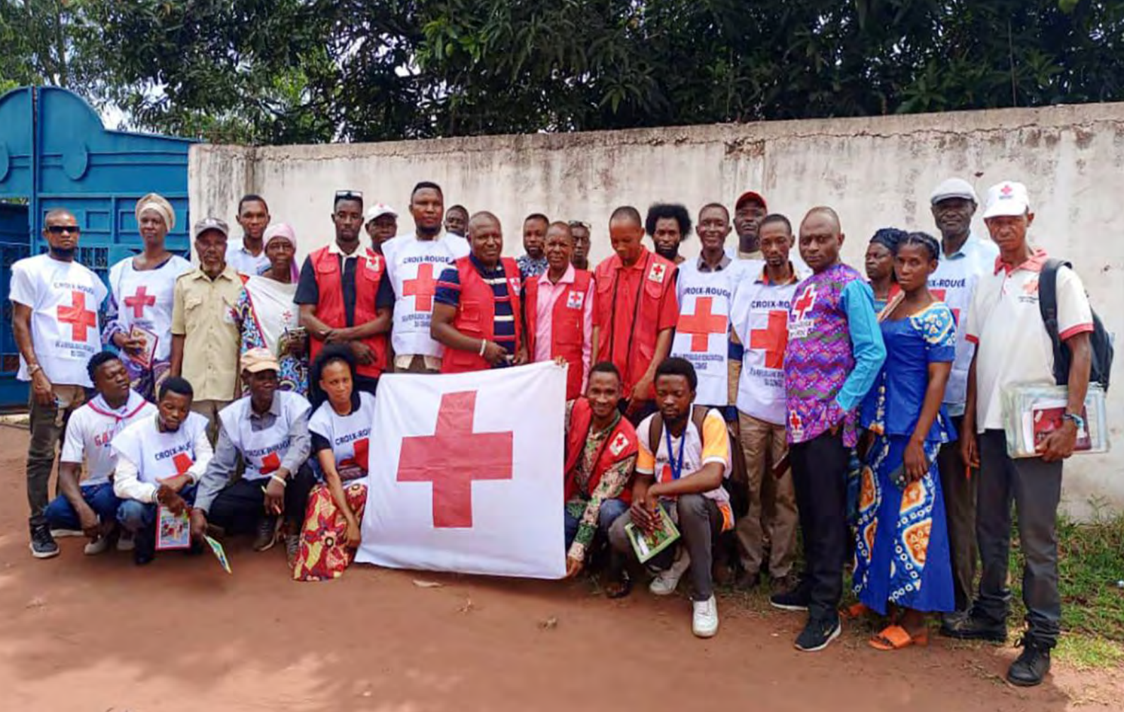
Since the start of the 16th Ebola outbreak in September 2025, DRC Red Cross volunteers have worked tirelessly to protect their communities by sharing lifesaving information, supporting affected families, and promoting safe practices on the ground