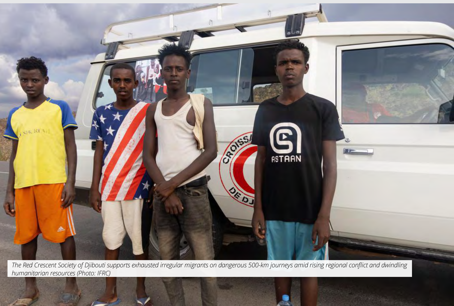
The Red Crescent Society of Djibouti supports exhausted irregular migrants on dangerous 500-km journeys amid rising regional conflict and dwindling humanitarian resources