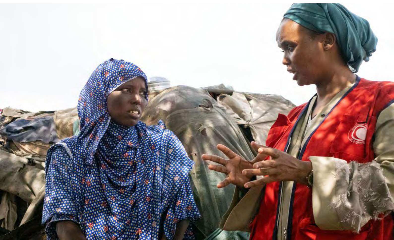
Red Crescent Society of Djibouti staff speaks to a cash beneficiary at Chekyeti, South Western Djibouti

IFRC mechanisms such as the Disaster Response Emergency Fund (IFRC-DREF) and Emergency Appeals will be drawn on as needed for the National Society to respond to disasters and crises.