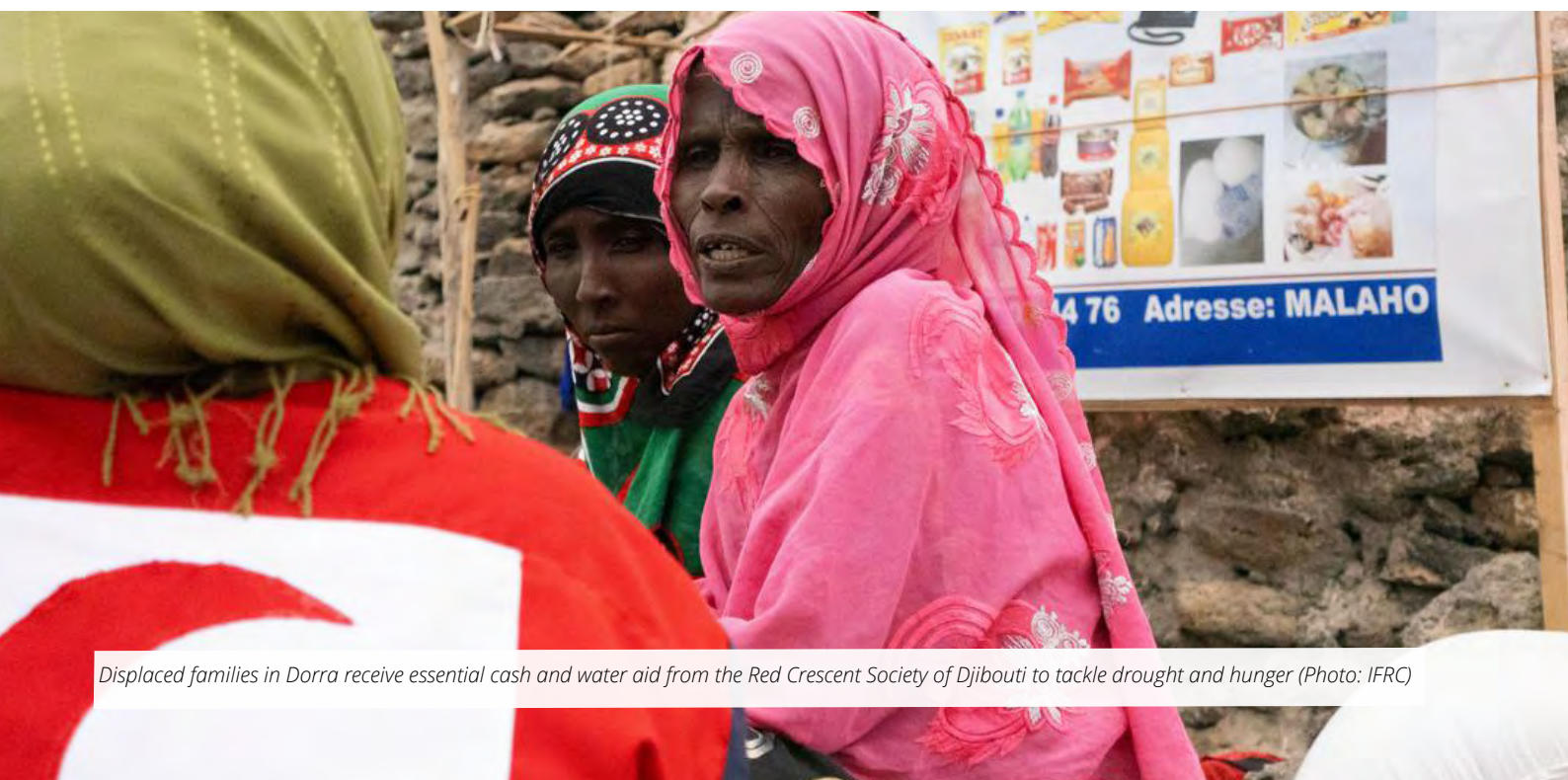
Displaced families in Dorra receive essential cash and water aid from the Red Crescent Society of Djibouti to tackle drought and hunger