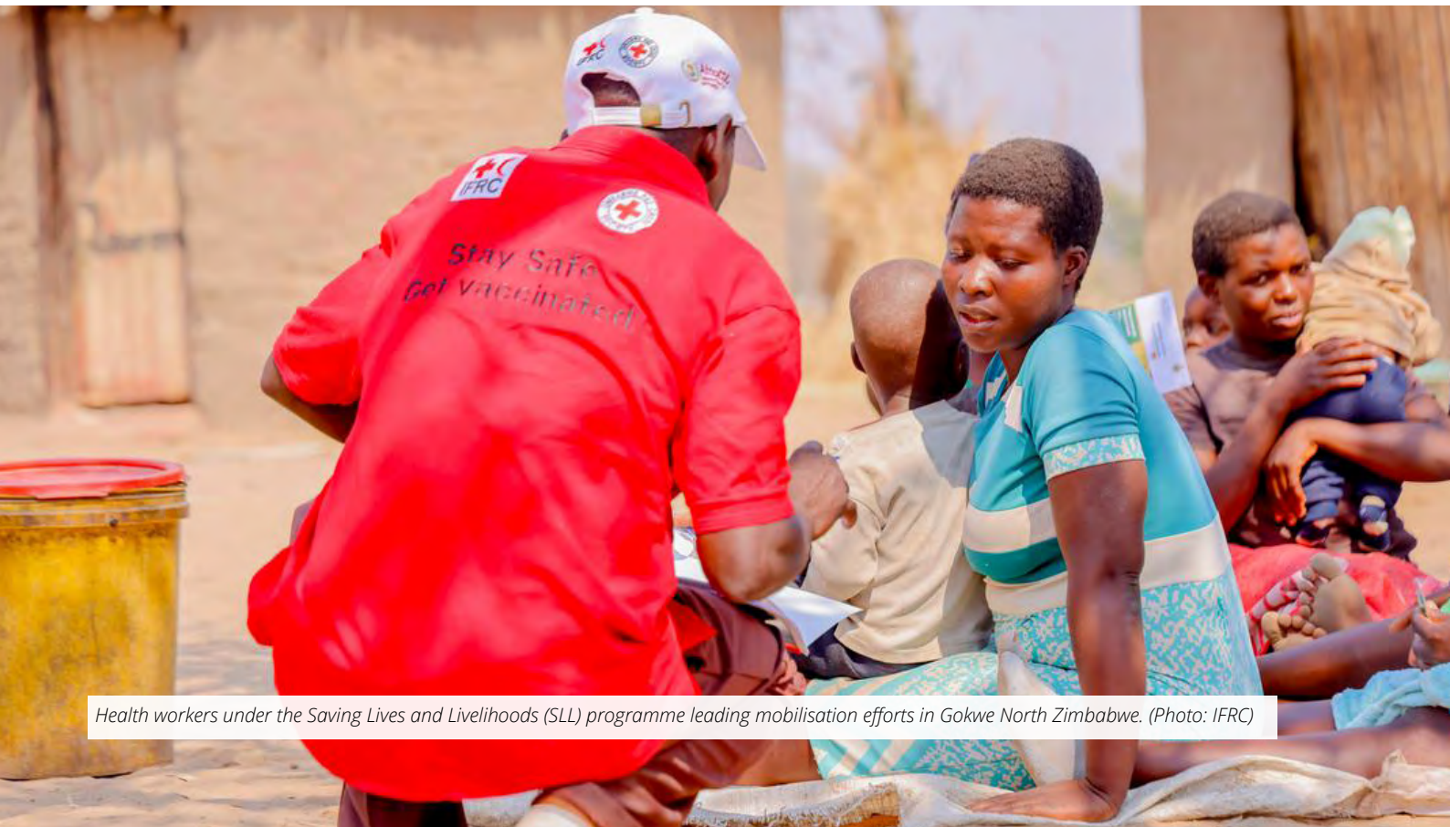
Health workers under the Saving Lives and Livelihoods (SLL) programme leading mobilisation efforts in Gokwe North Zimbabwe.

The Finnish Red Cross supports the National Society in the development of school capacities, education in emergencies, promoting climate change mitigation and adaptation and forecast-based financing .