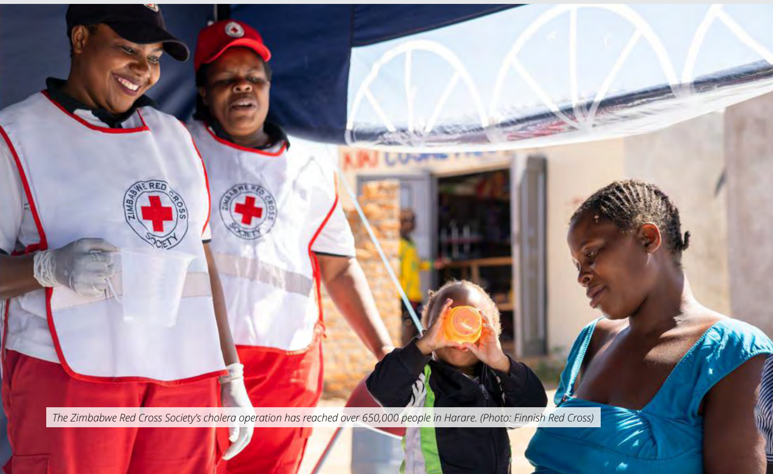
The Zimbabwe Red Cross Society's cholera operation has reached over 650,000 people in Harare.

World Bank Population below poverty line 38%