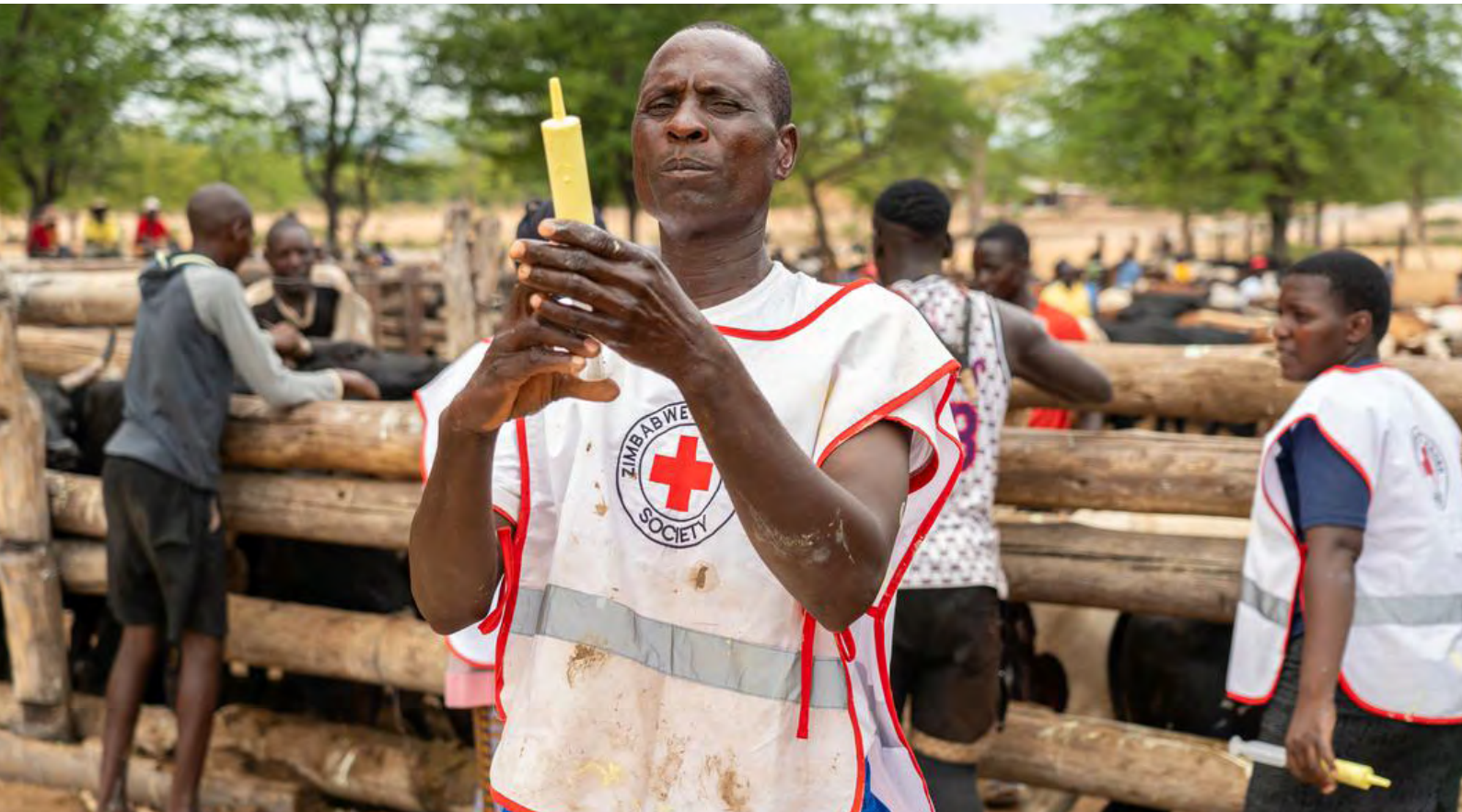
The Zimbabwe Red Cross Society's climate-smart disaster preparedness programme employs climate smart agricultural approaches.

The British Red Cross and the Finnish Red Cross will provide support to the National Society by linking it with global stakeholders in early warning and early action. It will provide technical support for emergencies and in development of early action protocols, among others.