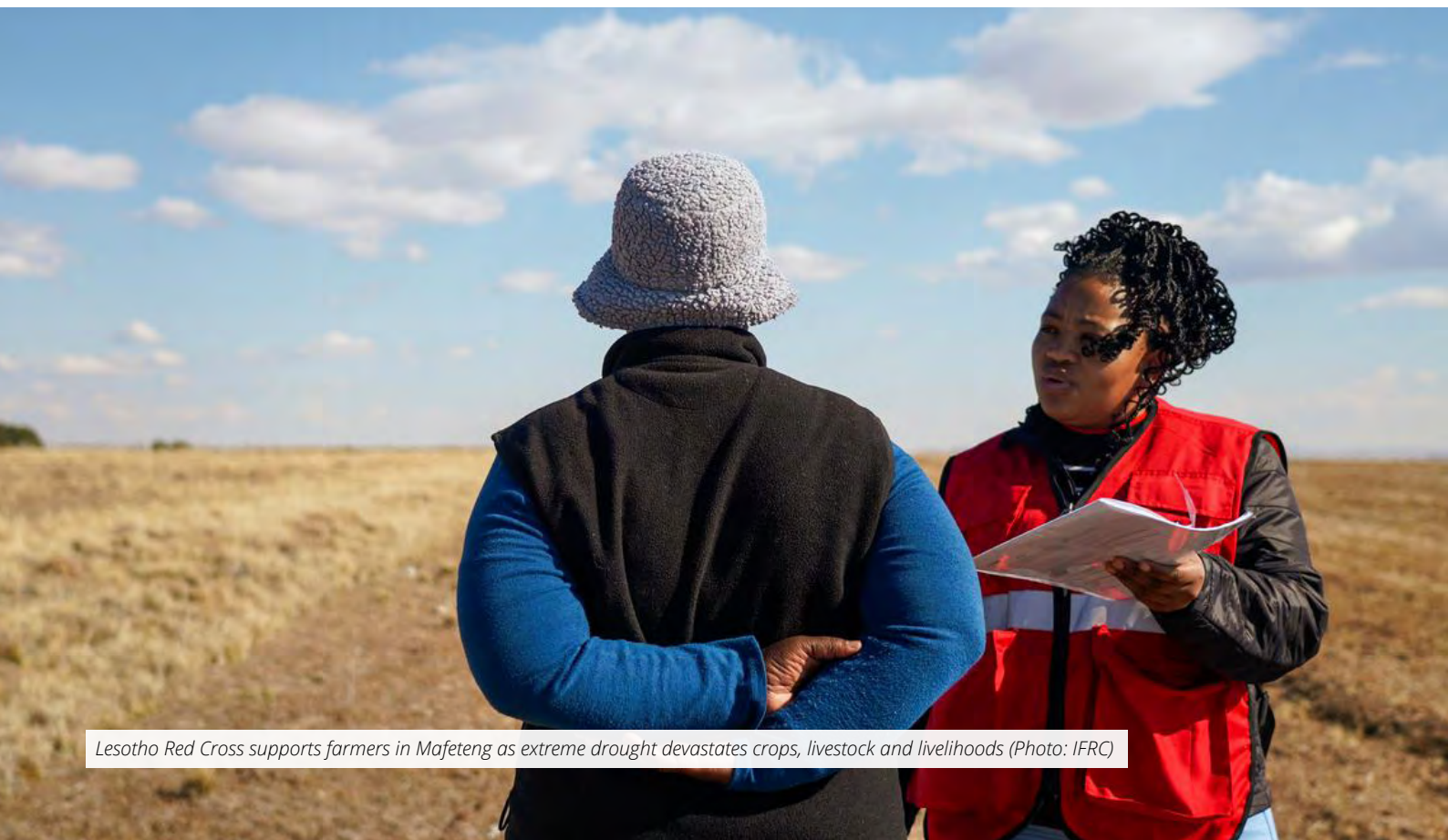
Lesotho Red Cross supports farmers in Mafeteng as extreme drought devastates crops, livestock and livelihoods

The Turkish Red Crescent provides support to the National Society in strengthening First Aid.