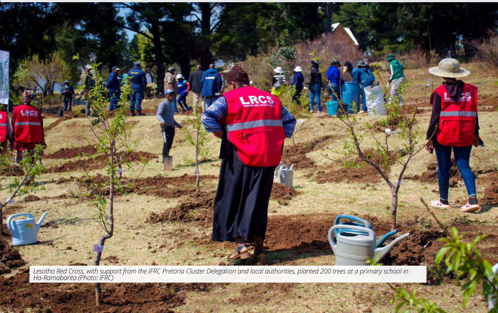
Lesotho Red Cross, with support from the IFRC Pretoria Cluster Delegation and local authorities, planted 200 trees at a primary school in Ha-Ramabanta