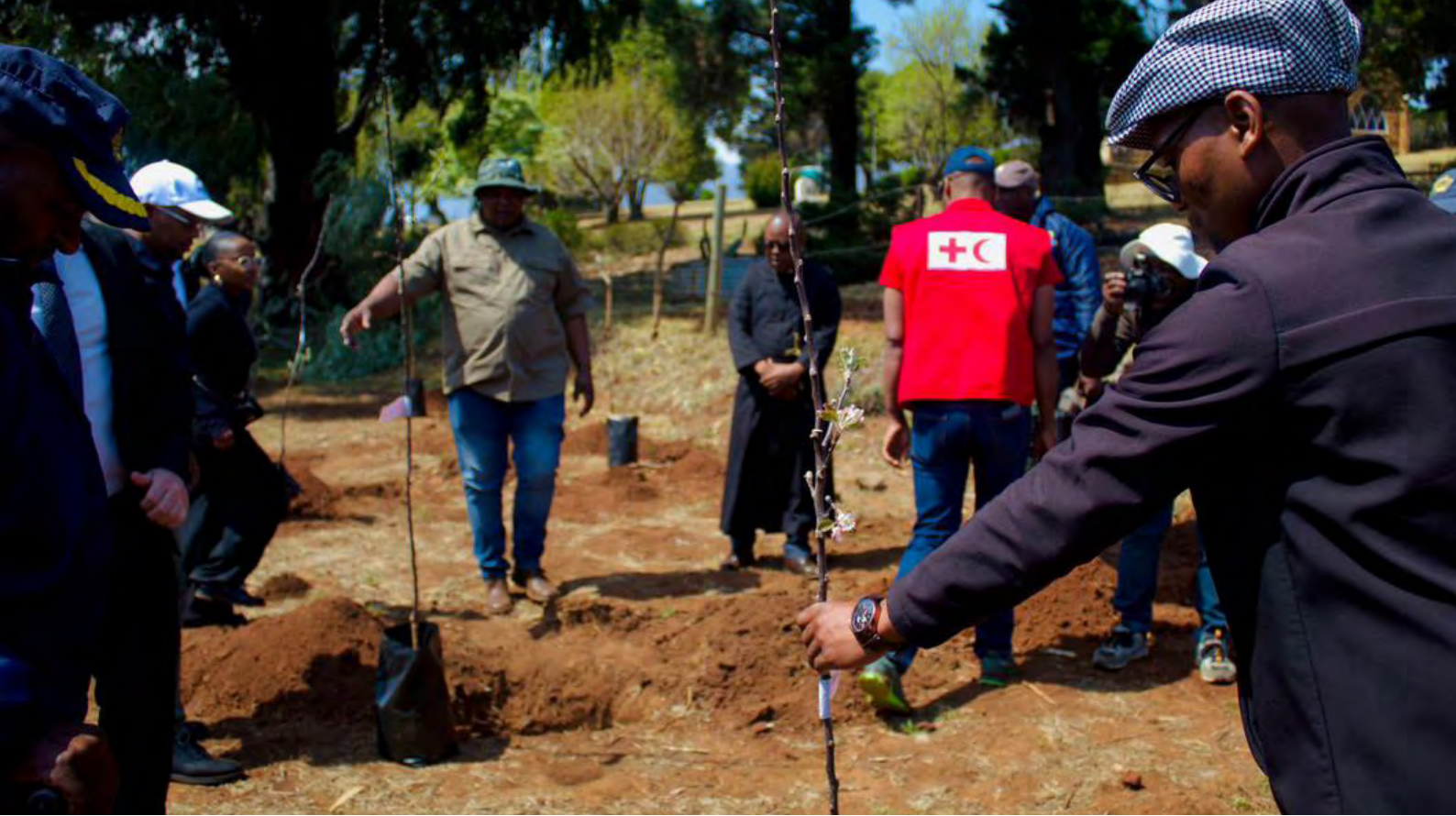
The Lesotho Red Cross Society carries out tree plantation as part of its response to climate initiative.