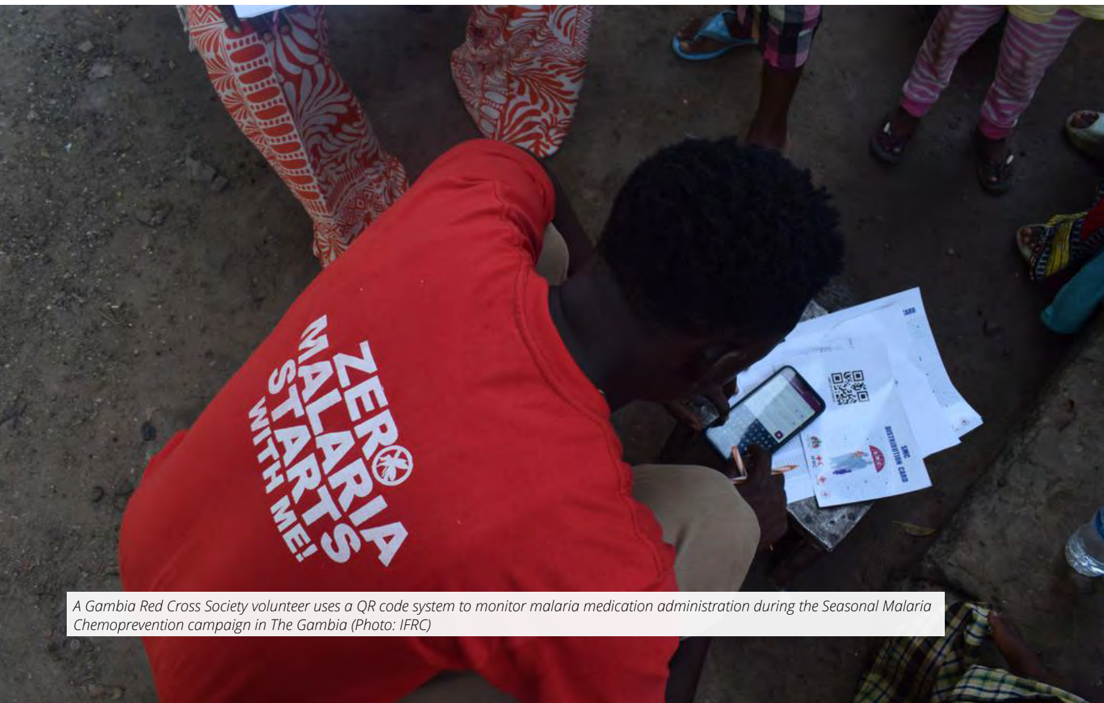
A Gambia Red Cross Society volunteer uses a QR code system to monitor malaria medication administration during the Seasonal Malaria Chemoprevention campaign in The Gambia

In addition, through the IFRC Capacity Building Fund, the Gambia Red Cross Society has implemented a community-based climate resilience and adaptation initiative in Marakissa Village and surrounding communities in the West Coast Region. The project focuses on youth, volunteers, and community members and combines capacity building with practical actions such as agroforestry, tree nursery management, composting, poultry production, and other locally appropriate climate resilience measures, strengthening community resilience and livelihoods.