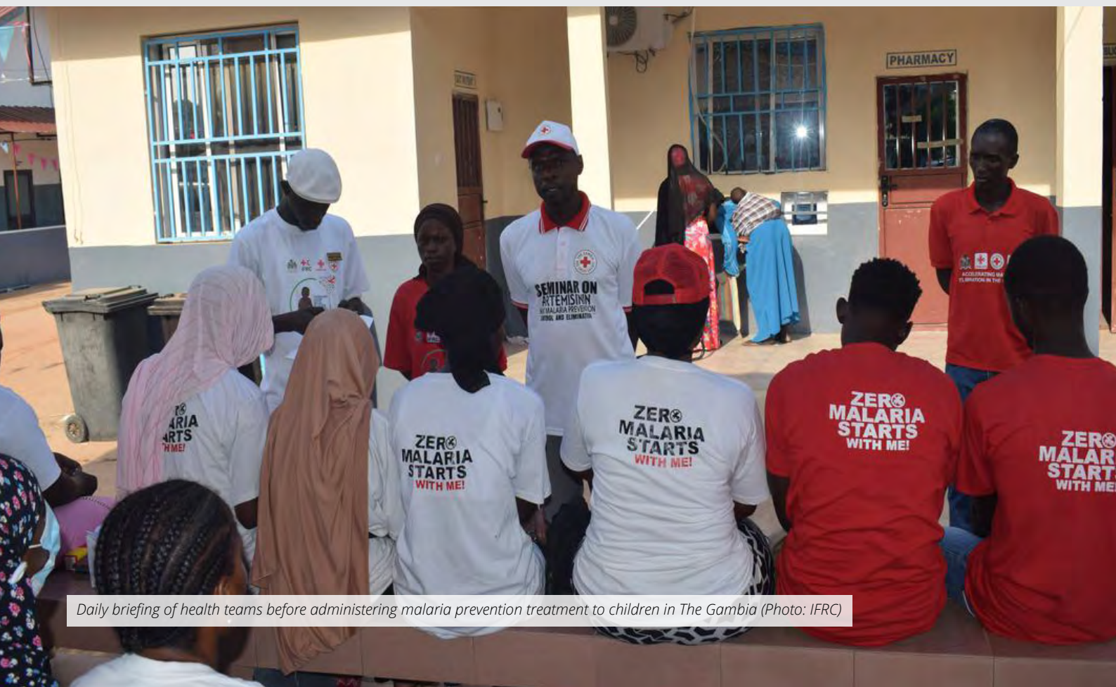
Daily briefing of health teams before administering malaria prevention treatment to children in The Gambia

World Bank Population below poverty line 53%