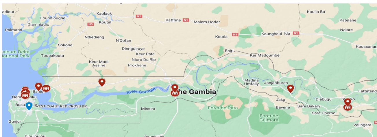
Map of The Gambia Showing the Location of Gambia Red Cross Society Branches

In 2023 , the Gambia Red Cross Society reached approximately 4,390 people through its disaster response and early recovery programmes.