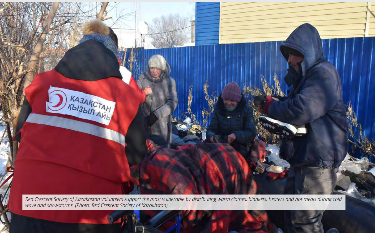
Red Crescent Society of Kazakhstan volunteers support the most vulnerable by distributing warm clothes, blankets, heaters and hot meals during cold wave and snowstorms.

World Bank Population below poverty line 5%