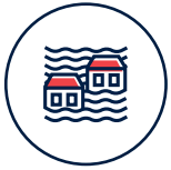
Floods and landslides