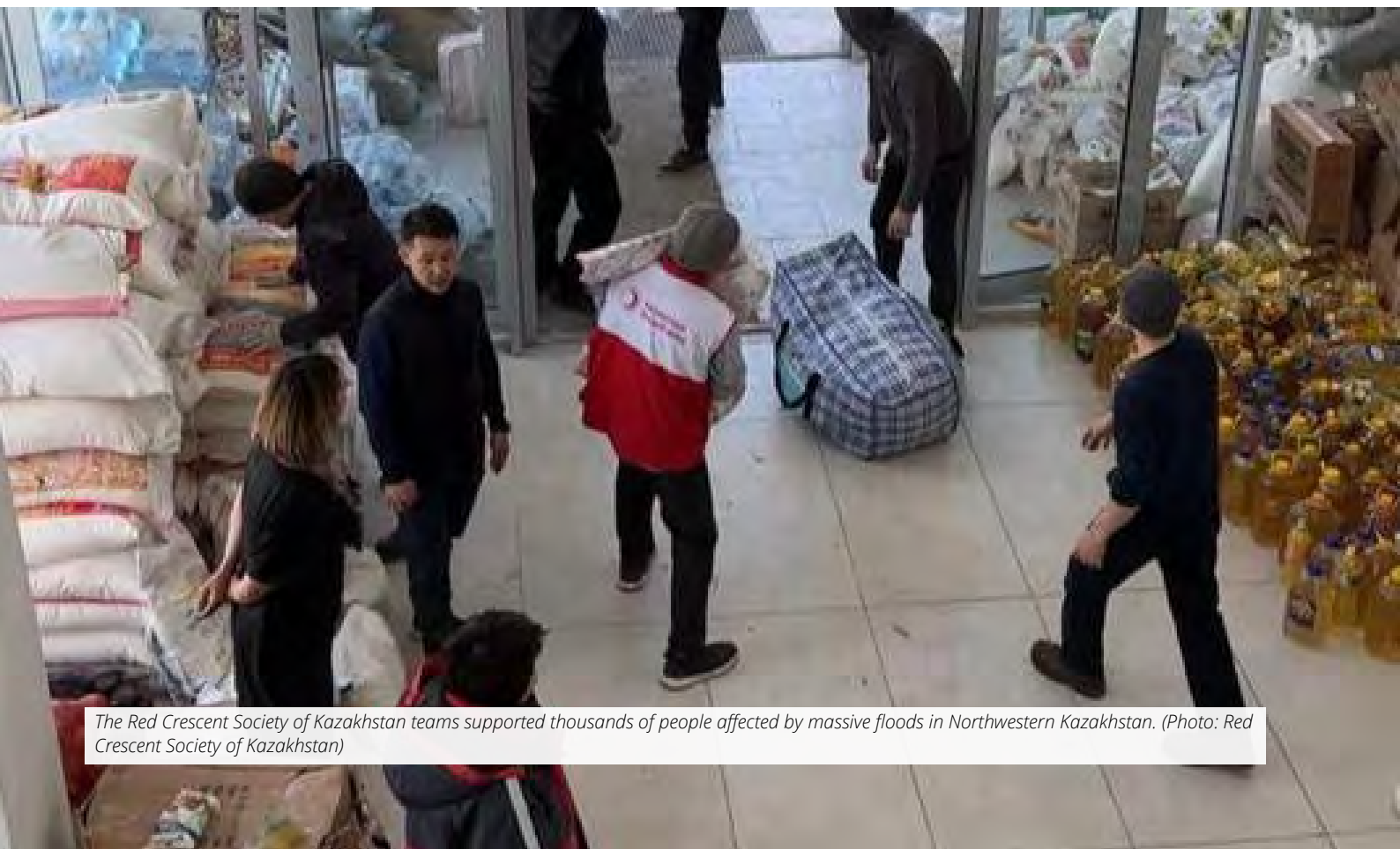
The Red Crescent Society of Kazakhstan teams supported thousands of people affected by massive floods in Northwestern Kazakhstan.

With the support of the Red Crescent Society of the United Arab Emirates , the Red Crescent Society of Kazakhstan provides financial assistance to orphans, children from low-income families, and multi-child families without fathers. The partnership began in 2002 with a joint project benefiting 50 children and has since expanded significantly, reaching approximately 4,000 children in 2023. Each child receives an annual allowance of CHF 475.27, equivalent to CHF 39.6 per month, until they reach adulthood.