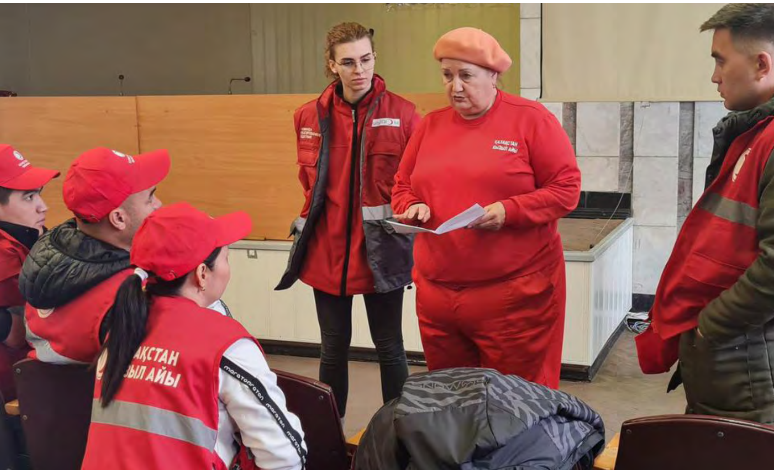
The Red Crescent Society of Kazakhstan teams support the families affected by the explosion at the Kostenko mine in Karaganda.

The IFRC also supports the Red Crescent Society of Kazakhstan in expanding the National Society's home care programme and initiating new tuberculosis and HIV care and support activities. The IFRC supports the National Society in promoting epidemic and pandemic preparedness and mental health and psychosocial support (MHPSS) integration into preparedness through humanitarian diplomacy.