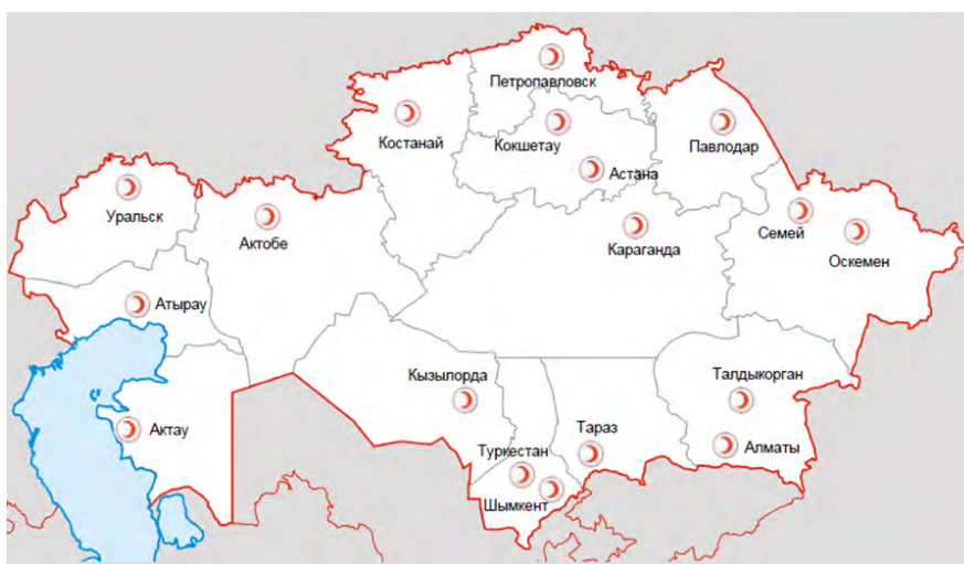
Map of the branches of the Red Crescent Society of Kazakhstan

In 2024 , the Red Crescent Society of Kazakhstan reached approximately 980,000 people with long term services and development programmes and 51,000 people with disaster response and early recovery programmes.