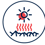
Heat waves/ cold waves