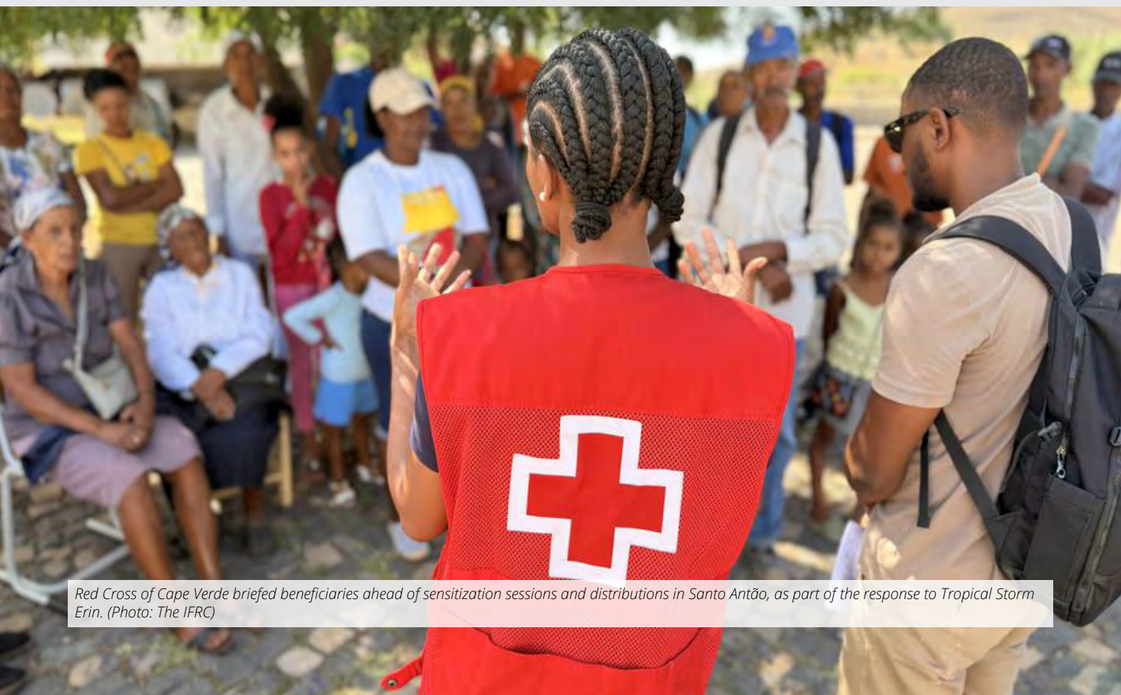
Red Cross of Cape Verde briefed beneficiaries ahead of sensitization sessions and distributions in Santo Antão, as part of the response to Tropical Storm Erin.

World Bank Population below poverty line 25%