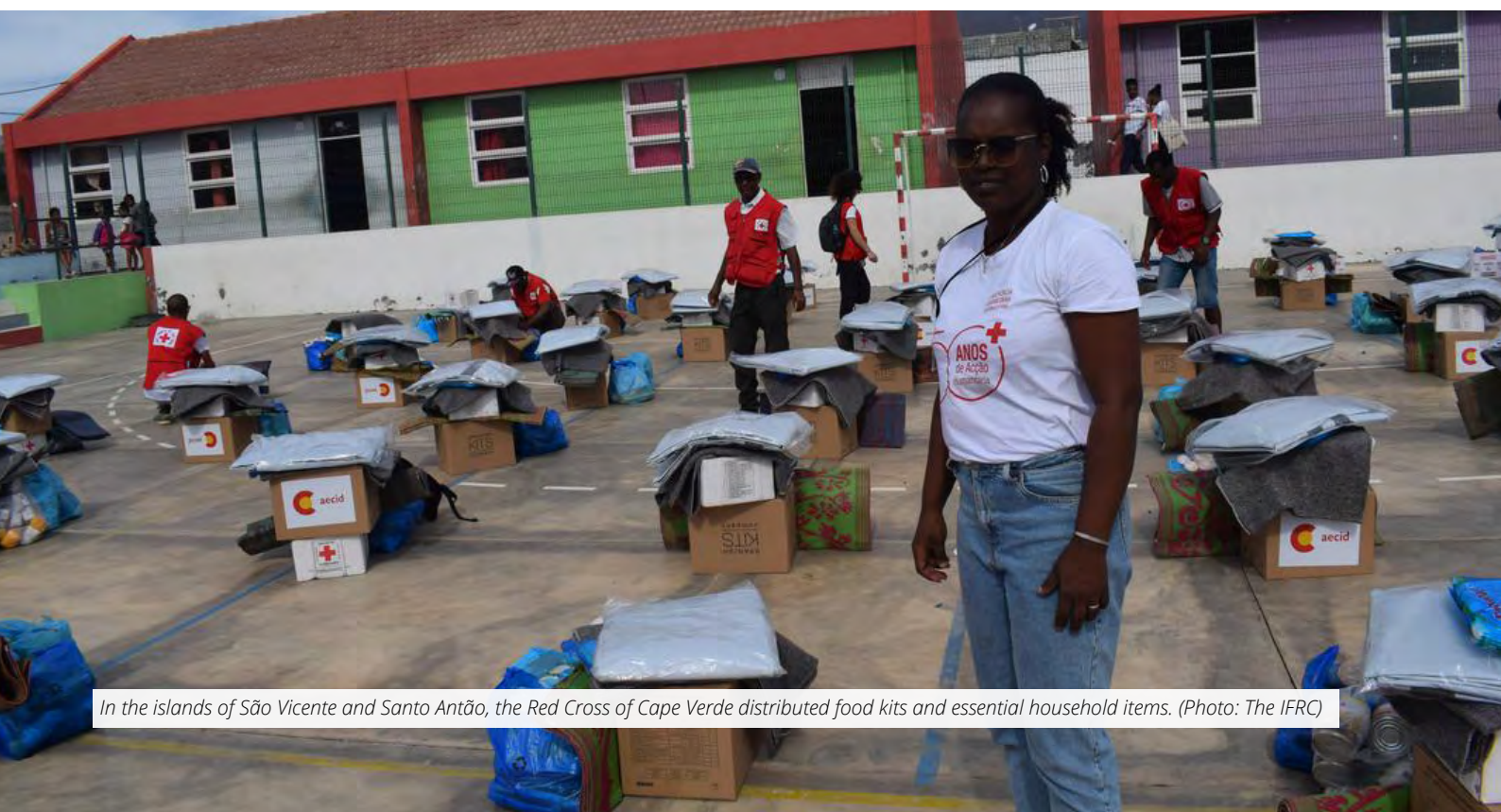
In the islands of São Vicente and Santo Antão, the Red Cross of Cape Verde distributed food kits and essential household items.

In recent years, the IFRC has supported the Red Cross of Cape Verde through numerous Emergency Appeals and Disaster Response Emergency Fund (DREF) operations.