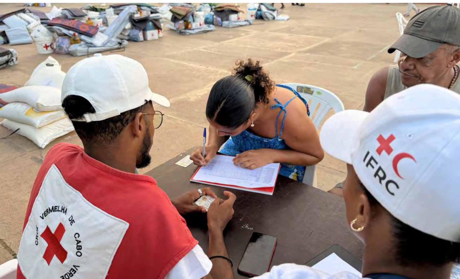
The Red Cross of Cape Verde volunteers verified beneficiary details ahead of kit distribution in Salamansa, one of the communities hardest hit by Tropical Storm Erin.

IFRC-DREF Dengue Outbreak : The DREF allocation of CHF 398,658 in September 2024 supported the Red Cross of Cape Verde in assisting more than 30,000 people affected by the sharp rise in the number of cases. The National Society supported the targeted people over a six-month period with assistance such as the distribution of multipurpose cash, water , sanitation , and hygiene (WASH) interventions, community engagement and protection, among others.