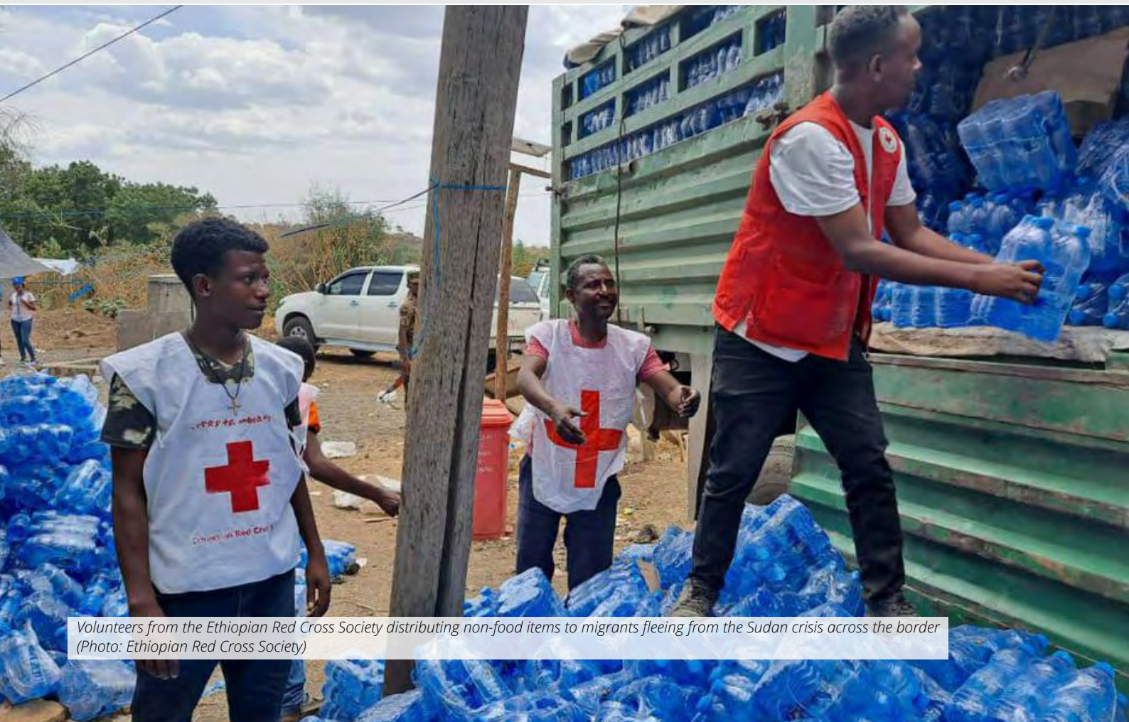
Volunteers from the Ethiopian Red Cross Society distributing non-food items to migrants fleeing from the Sudan crisis across the border