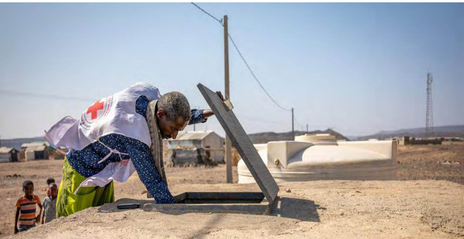
The Ethiopian Red Cross Society constructed water facilities to reduce water-borne diseases.

The IFRC will provide critical technical and financial support to help the National Society achieve its health and wellbeing goals and deliver effective humanitarian services. This includes mobilizing resources, offering tailored technical assistance, and strengthening systems for emergency preparedness and sustainable development. Through training, mentoring, and capacity-building, the IFRC aims to enhance the National Society's resilience, operational effectiveness, and self-reliance, ensuring alignment with global humanitarian standards.