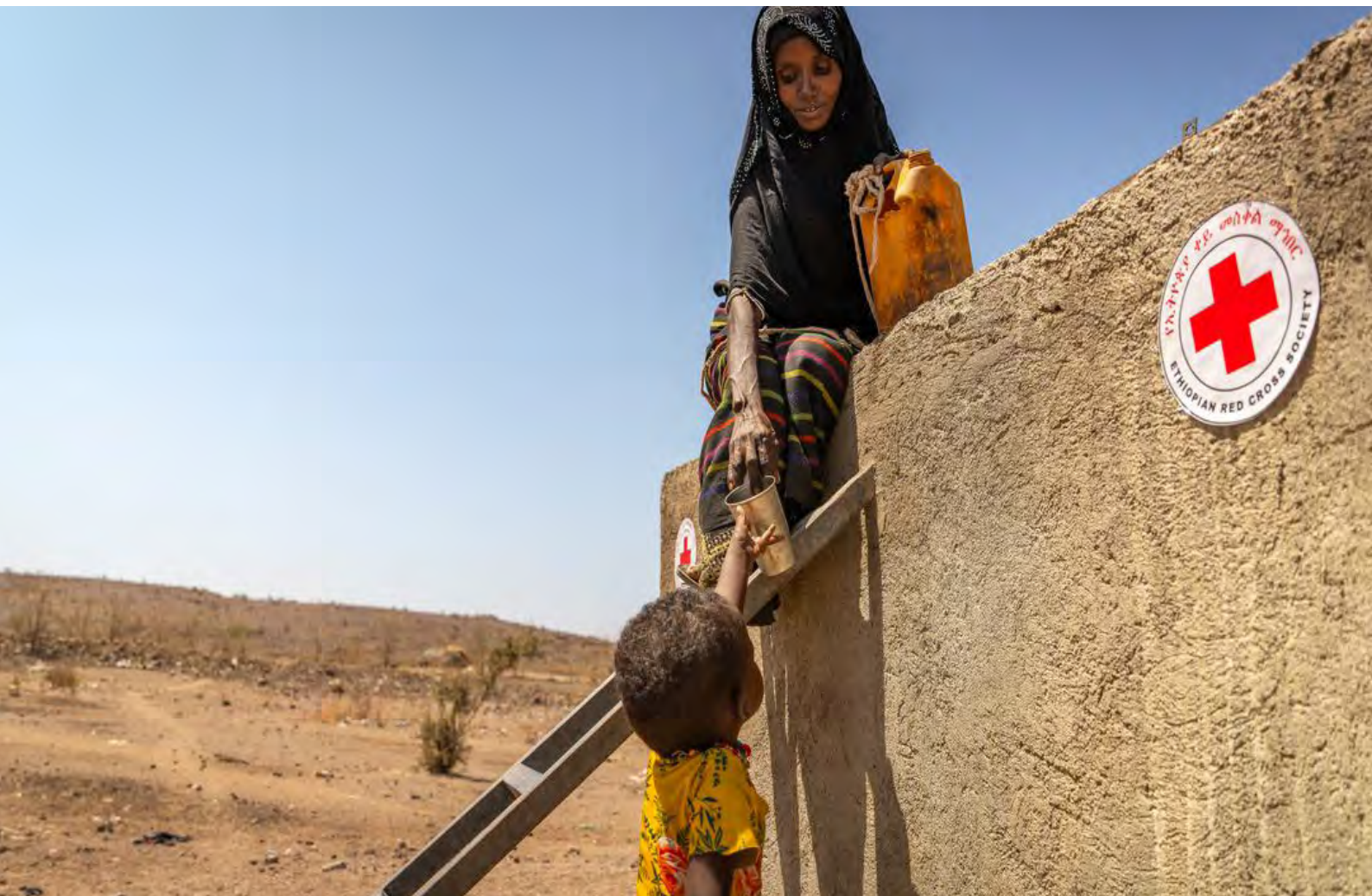
The construction of smaller storage for safe drinking water provides support to families to gather and store rainwater.

The IFRC will support the National Society in strengthening operational readiness and service quality by enhancing institutional capacity, improving talent and volunteer management, and promoting accountability. It will also help the Ethiopian Red Cross Society build sustainable, multi-year partnerships with diverse stakeholders to secure funding and pilot innovative financing models. Additionally, IFRC will assist the expansion of access to resources for National Society Development (NSD) through funding mechanisms. IFRC funding mechanisms such as the IFRC Capacity Building Fund (CBF), the IFRC-ICRC National Society Investment Alliance (NSIA) and the Empress Shoken Fund enable National Society's to target development initiatives.