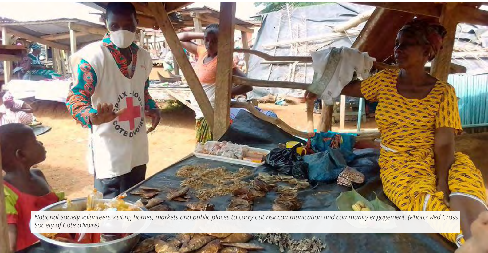
National Society volunteers visiting homes, markets and public places to carry out risk communication and community engagement.

Since the 2021 inclusive legislative elections, Côte d'Ivoire has maintained political and social stability. A national reconciliation process ensued after a political dialogue involving the government, political parties, and civil society. Municipal and regional elections are set for September 2023, marking crucial moments for key political parties such as RHDP, PDCI-RDA, and PPA-CI ahead of the 2025 presidential election.