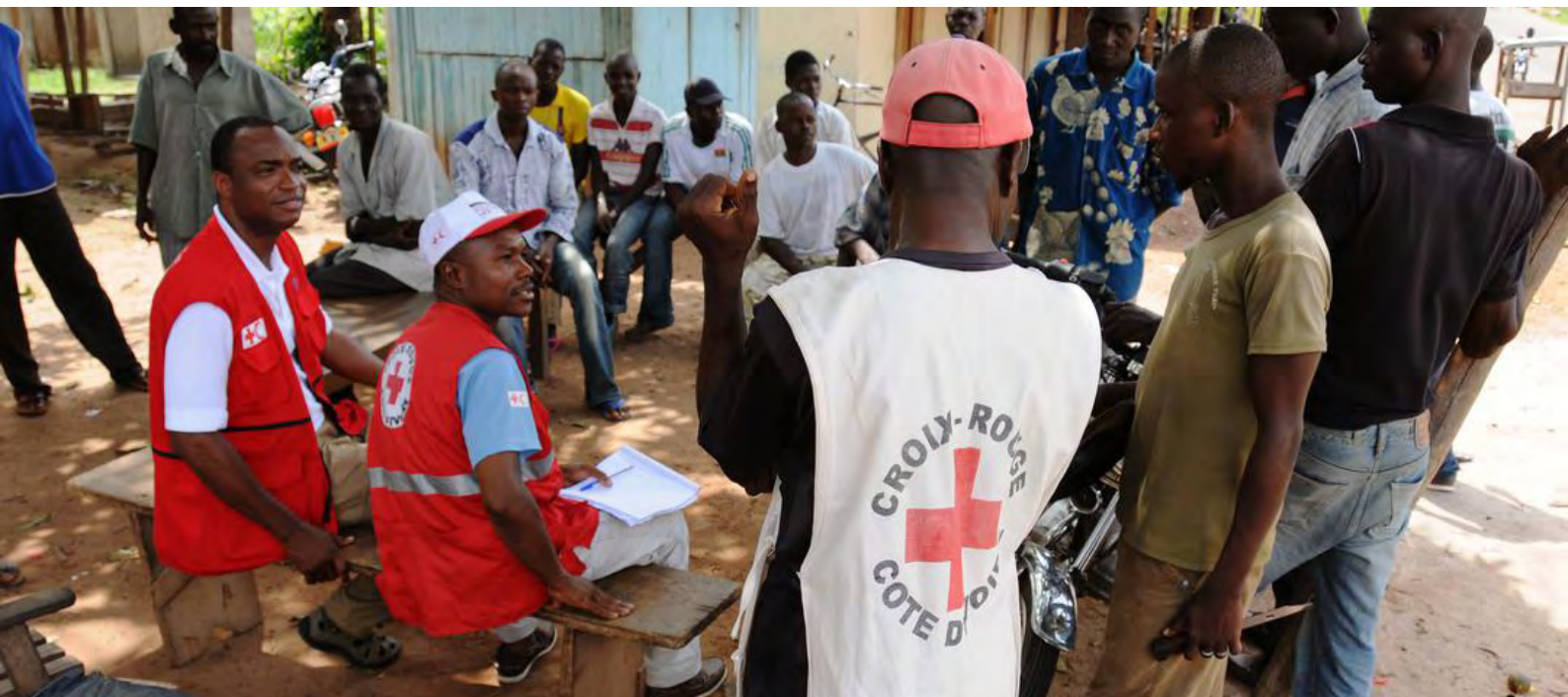
National Society volunteers providing support for people affected by post-election violence in Côte d'Ivoire.

The Monaco Red Cross supports the National Society in a project aimed at improving the living and working conditions for children in vulnerable situations and strengthening the local child protection systems.