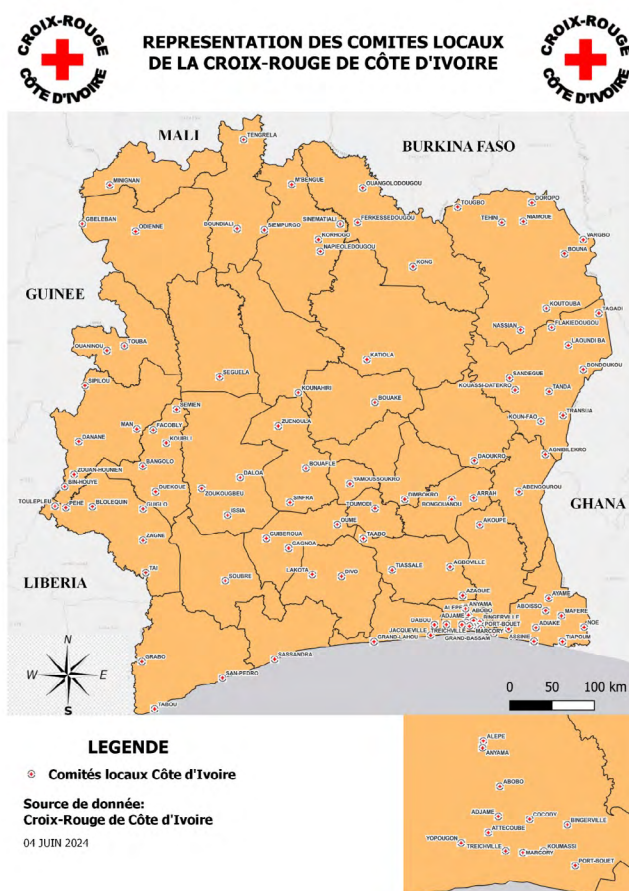
Map of the Red Cross Society of Côte d'Ivoire branches

In 2023 , the Red Cross Society of Côte d'Ivoire reached approximately 12,000 people through its climate risks awareness programmes programmes, and more than 900 people through its disaster response and early recovery programmes.