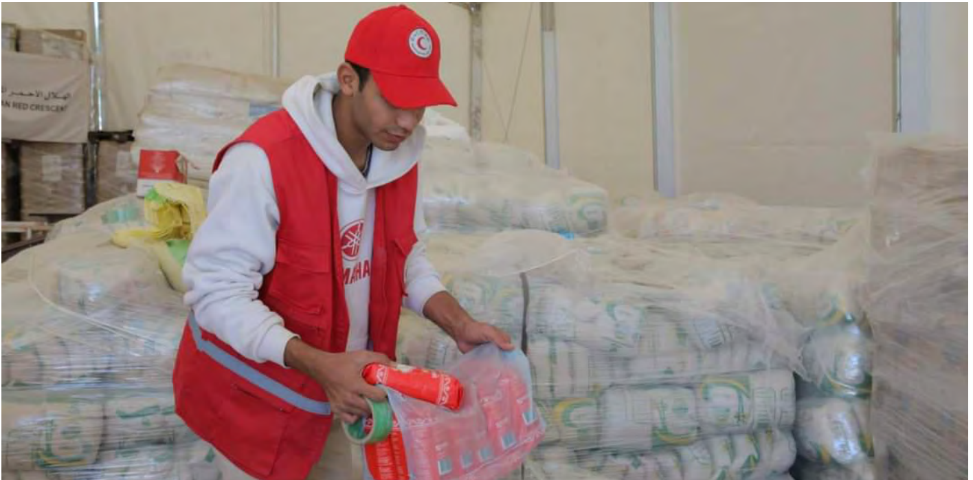
The Egyptian Red Crescent Society provided essential items as part of emergency response efforts

The Netherlands Red Cross provides support to the National Society in enhancing community resilience against climate change impacts.