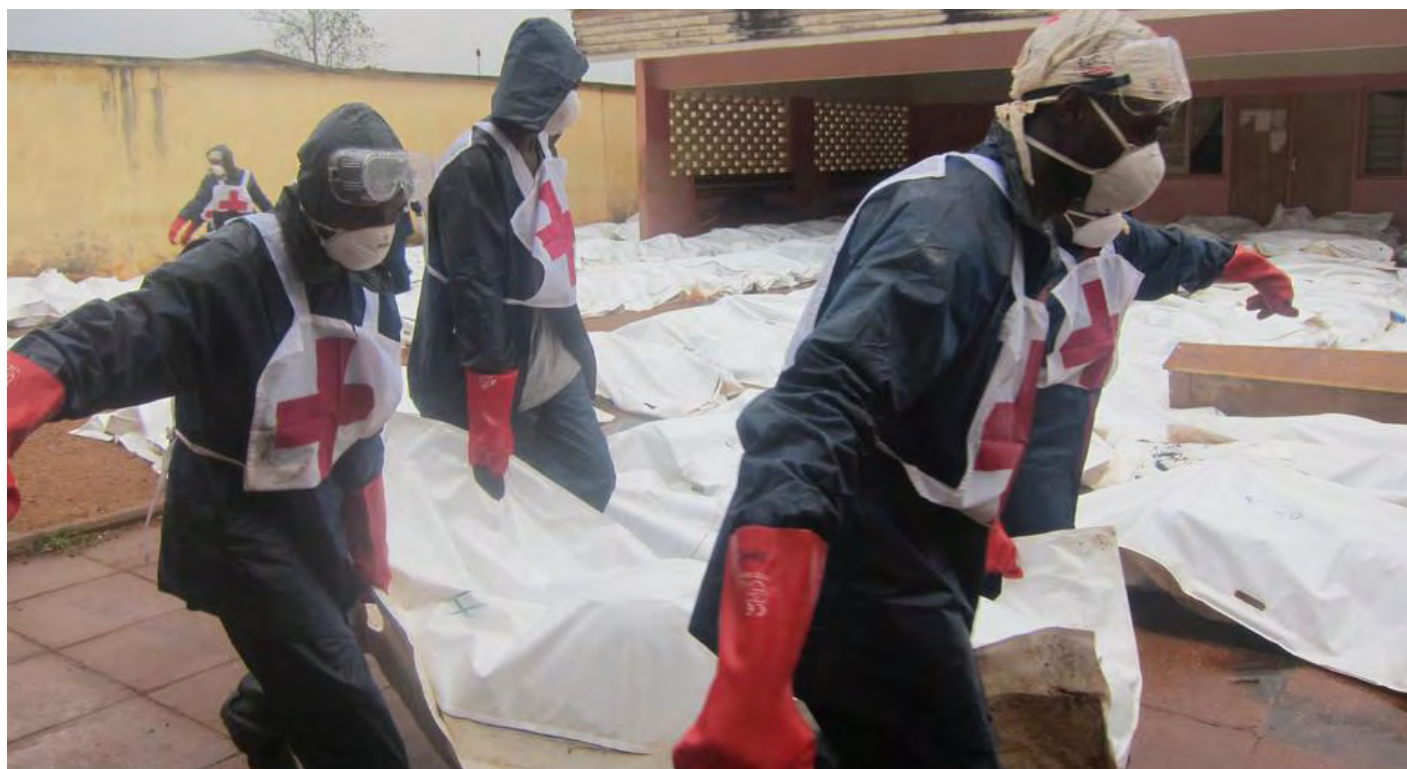
National Society volunteers responding to conflict by collecting bodies and arranging dignified burials

During the reporting period, the Central African Red Cross Society focused on climate change adaptation. It also initiated child protection project and conducted training for 14 National Disaster Response Teams.