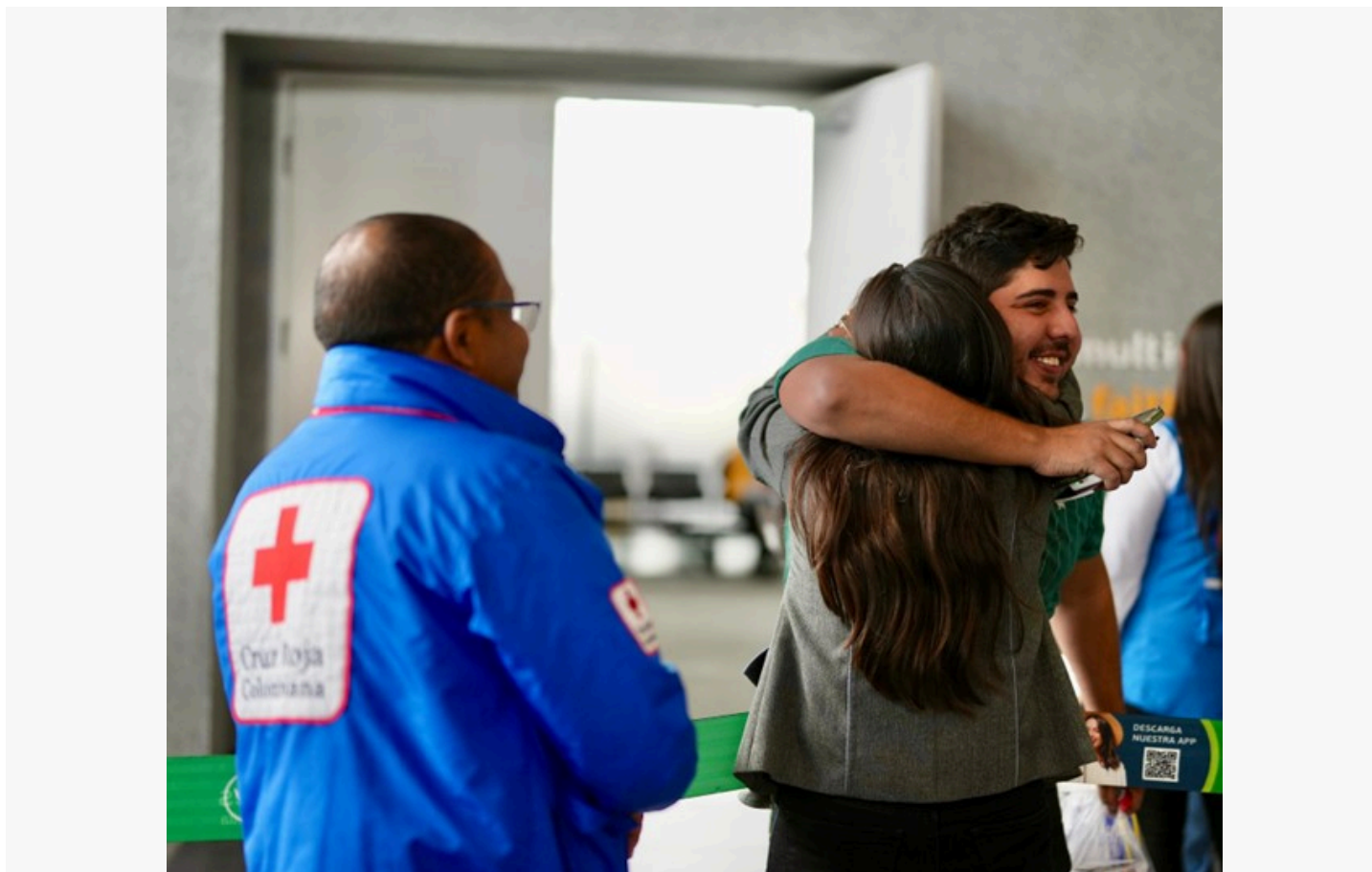
Colombian Red Cross attention to national migrants deported from United States to Colombia. El Dorado International Airport, January 28, 2025.