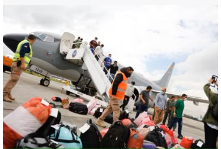
Arrival of deportation flights from the US to El Dorado International Airport, January 28, 2025.