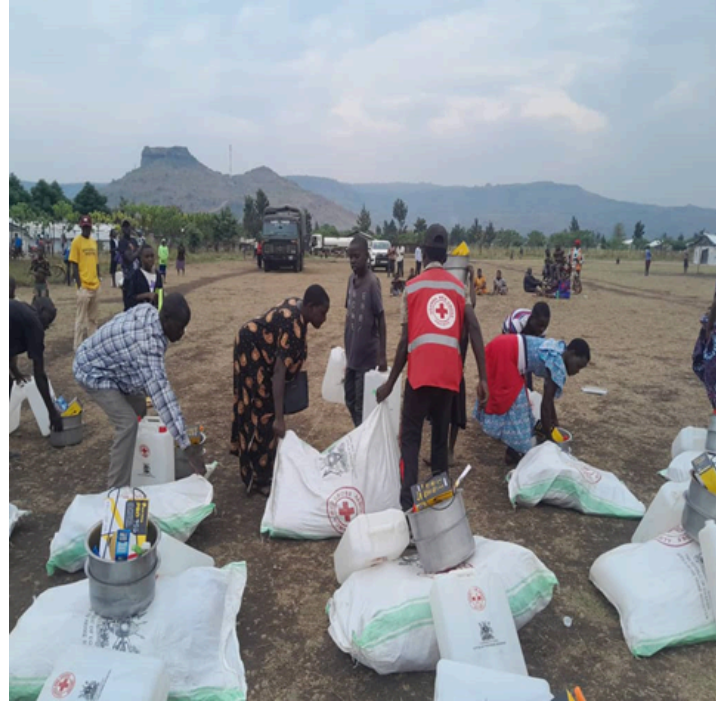
Distribution of NFI Kits at the reception centre