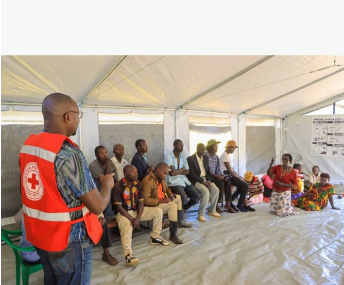
URCS Volunteer conducting hygiene promotion

On the 9th of February 2025, all the households living at the school and those at the school staff quarters were again relocated to the new/permanent holding centre that is about 2km away from the school and within Bunambutye camp surrounding. Decision was due to school re-opening in February 2025. URCS quickly supported the relocation and reassembly with shelter assistance. The NS also promptly reoriented the ongoing assistance to the new situation and relocation sites, ensuring relevant and coordinated intervention. To accommodate the context changes and align with the new priorities, this DREF operation remains flexible.