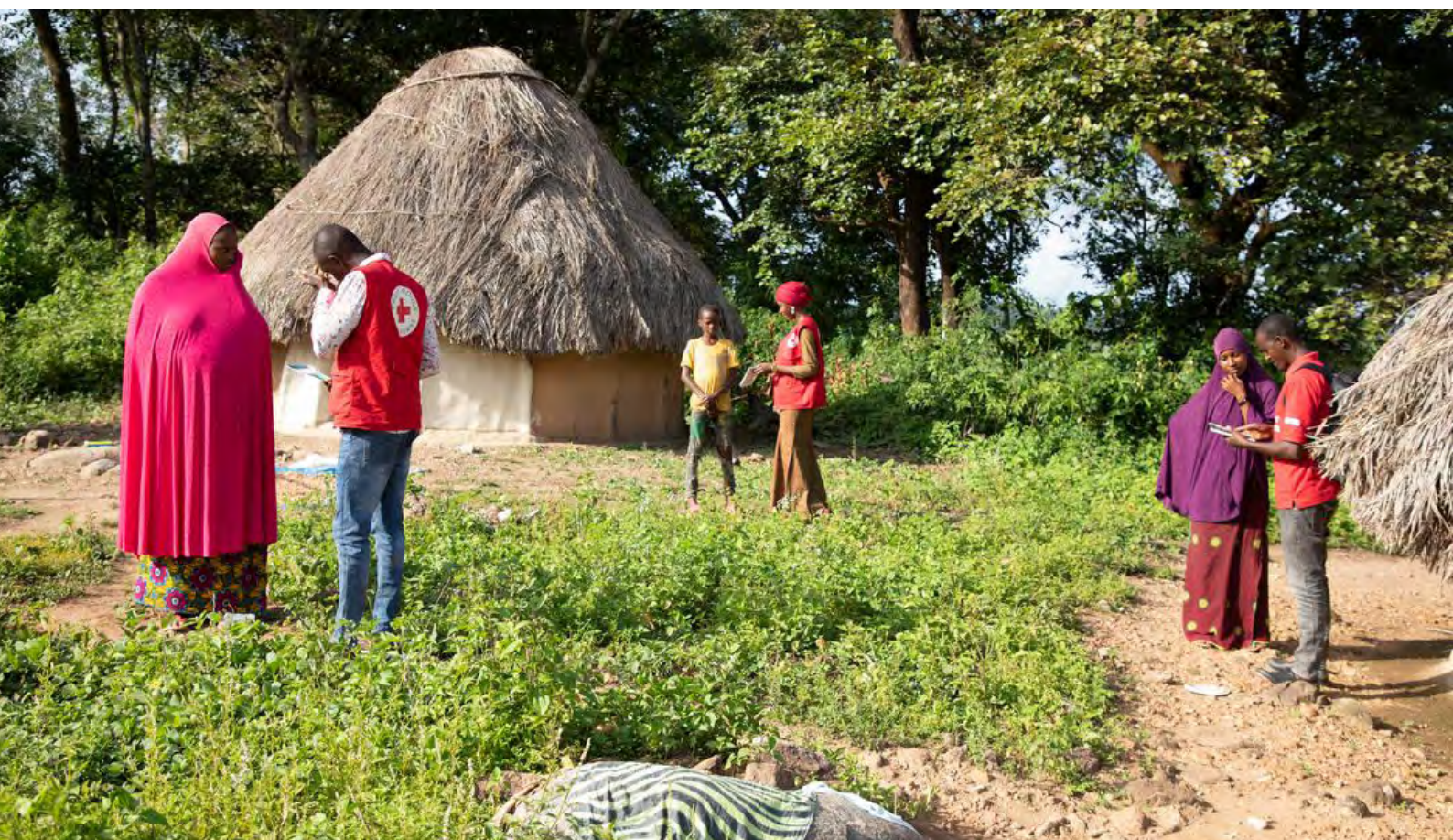
Red Cross Society of Guinea volunteers conducted community-based surveillance system to tackle rabies as part of community epidemic and pandemic preparedness programme.