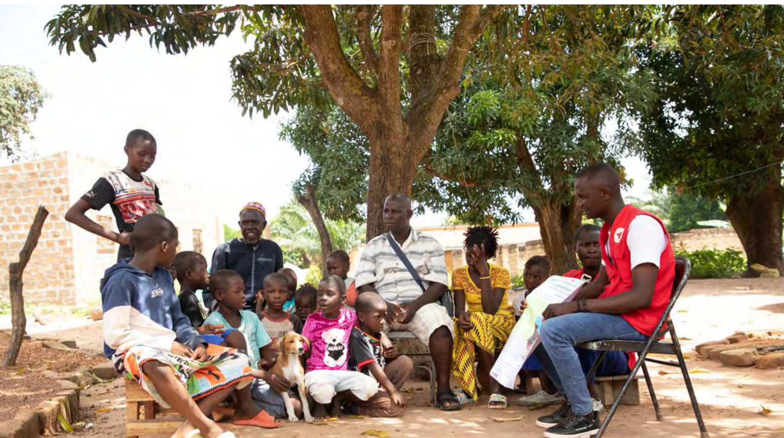
Red Cross Society of Guinea volunteers sensitizing communities on rabies risks and ways to stay safe.

The Red Cross Society of Guinea is involved in the four IFRC Pan-African Initiatives focusing on Tree Planting and Care, Zero Hunger, Red Ready and National Society Development.