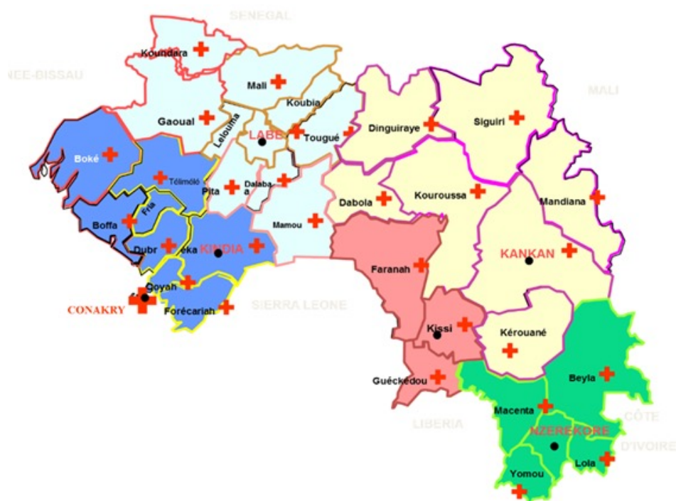
Map of the Red Cross Society of Guinea branches

In 2023 , the National Society reached more than 83,000 people through its disaster response and early recovery programmes and more than 32,000 people through its long term services and development programmes.