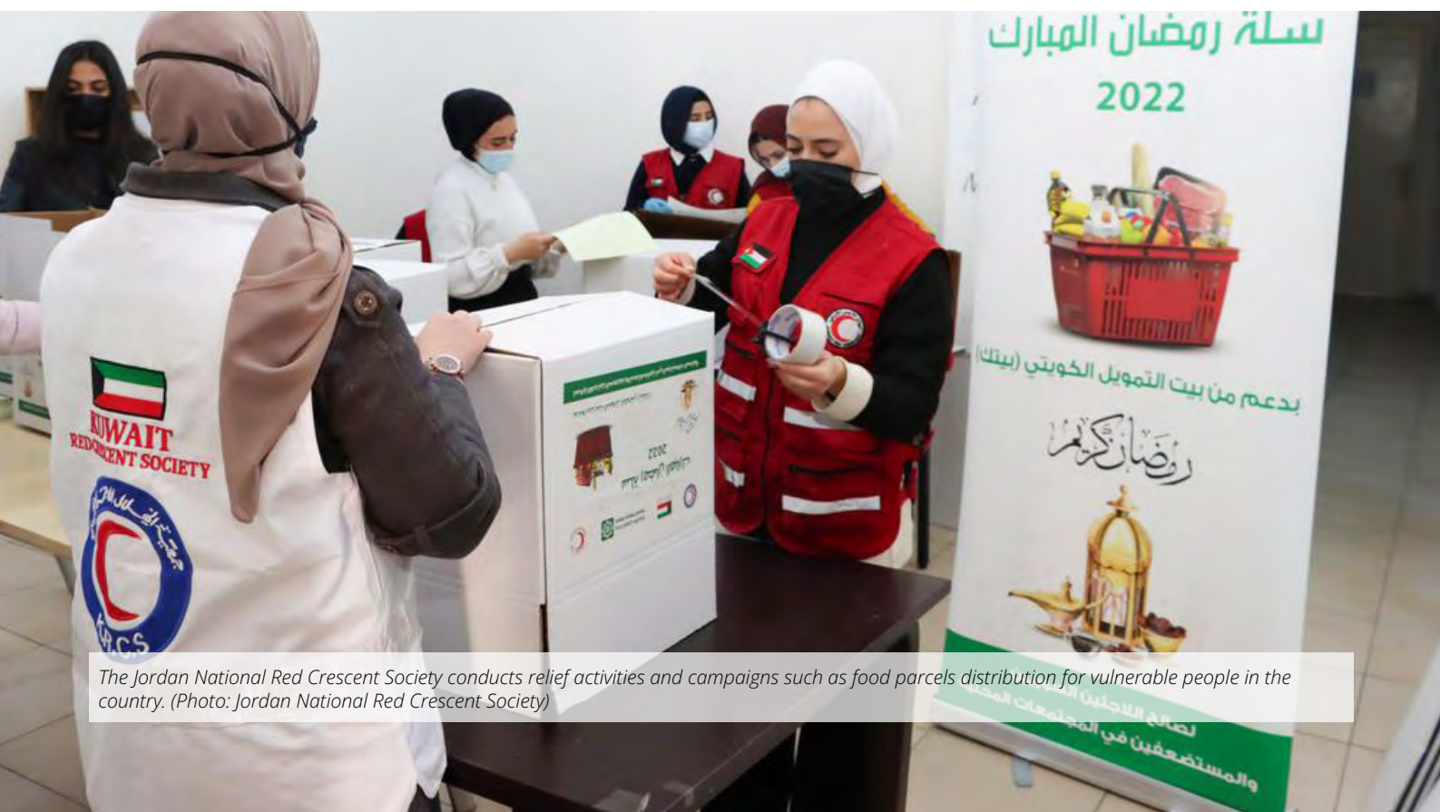
The Jordan National Red Crescent Society conducts relief activities and campaigns such as food parcels distribution for vulnerable people in the country.