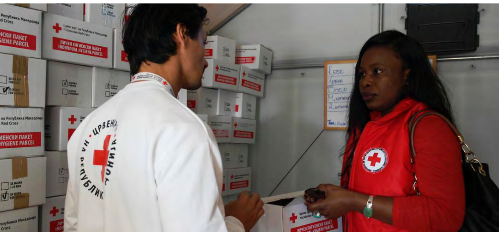
Red Cross of the Republic of North Macedonia actively supports transit camps, assisting with food, water, first aid, hygiene kits, baby supplies, clothing, and tracing services, while preparing heated mobile houses for the approaching winter.