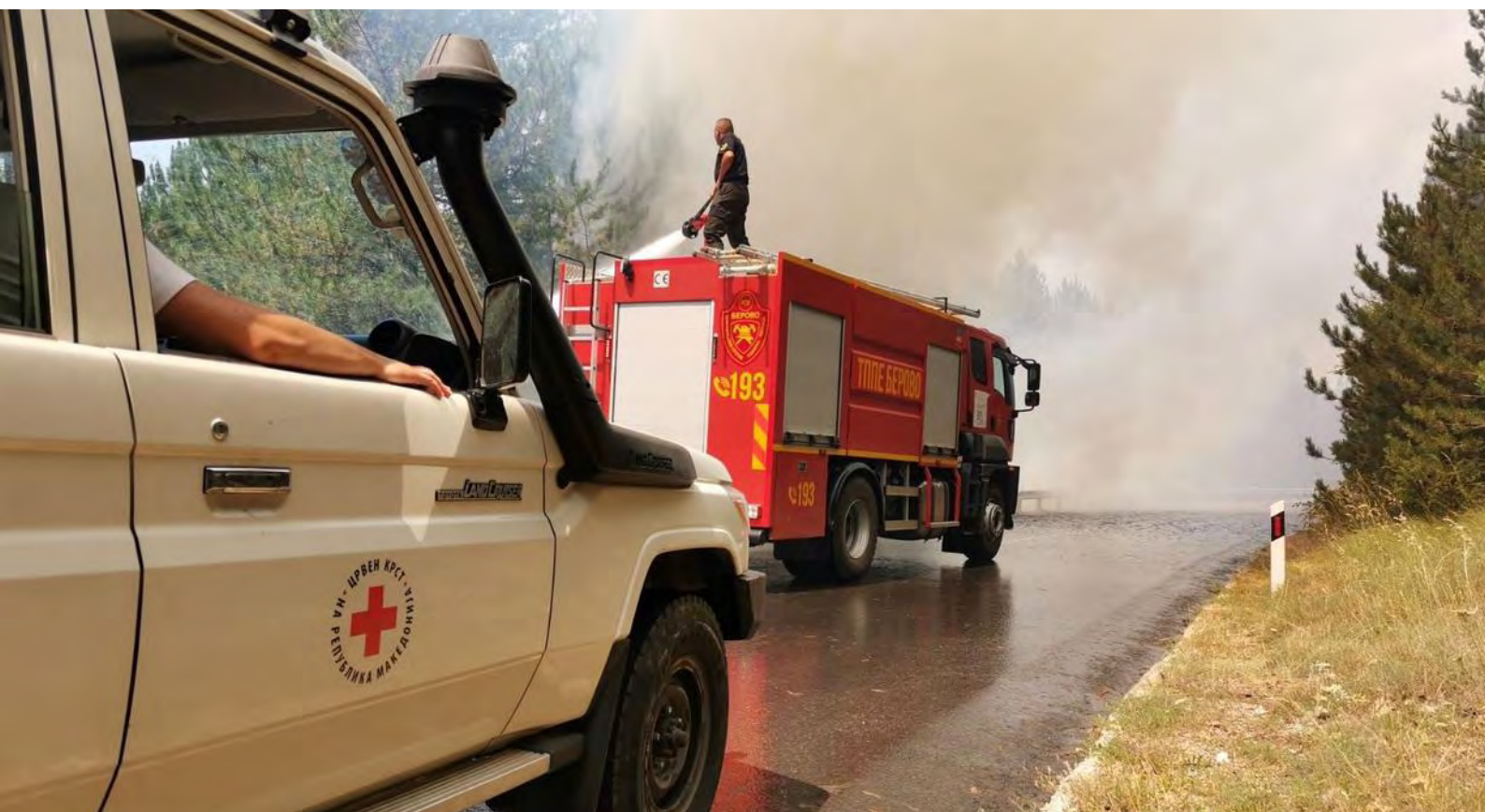
The Red Cross of the Republic of North Macedonia provides immediate support to response teams in case of emergencies by distributing food and drinking water to affected people.

The IFRC will aid the National Society in establishing transparent financial systems, robust reporting mechanisms, and efficient procurement processes, fostering accountable resource use and donor confidence. Additionally, it supports evaluations and assessments to identify areas for improvement, enhancing programme implementation, and adaptive strategies. Through training and technical assistance, the IFRC will strengthen the National Society's capacity in project management, monitoring, evaluation, and data analysis. Moreover, it will facilitate knowledge exchange platforms for sharing experiences and best practices with other National Societies, fostering continuous improvement and innovation in humanitarian efforts.