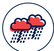
Extreme weather conditions