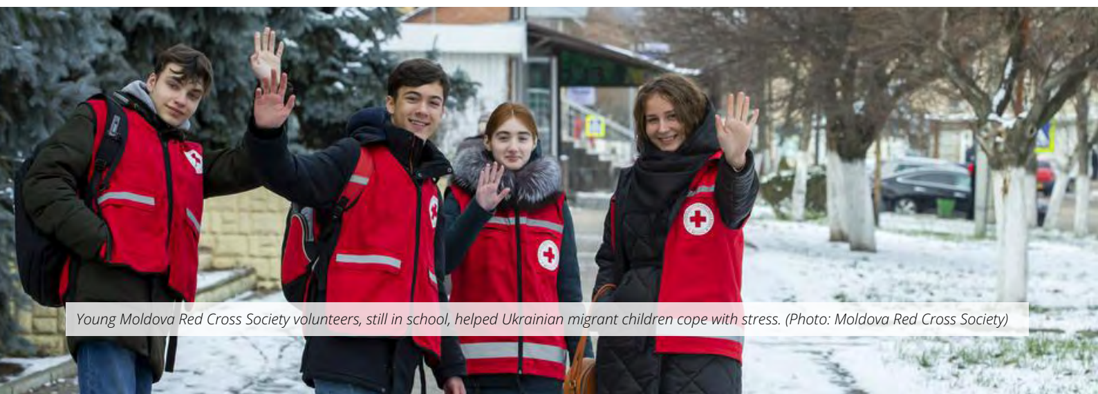
Young Moldova Red Cross Society volunteers, still in school, helped Ukrainian migrant children cope with stress.

The Swedish Red Cross will support with the mainstreaming and anchoring of PGI and CEA across operations and programmes.