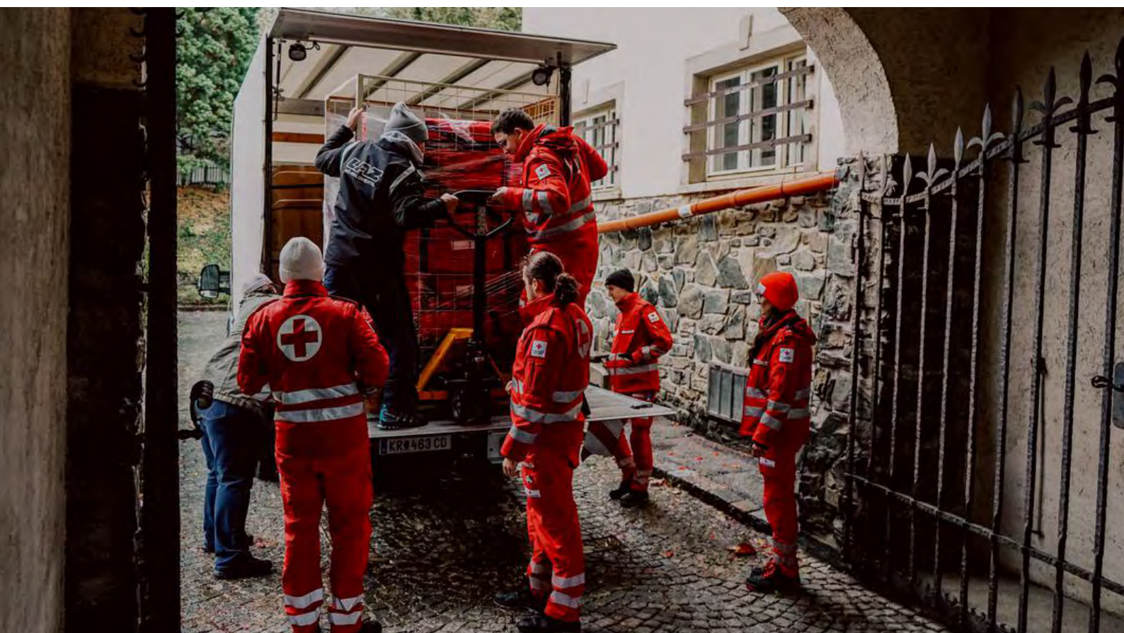
In September 2024, Red Cross volunteers tirelessly assisted 3,000 displaced Lower Austrians amid torrential storms and massive flooding that echo the 2002 crisis.

The Swiss Red Cross will support the National Society in implementing fraud and corruption policies. It will also support the digitalization and operationalization of the developed policies, ensuring that the National Society can efficiently implement and integrate these processes into its daily operations.