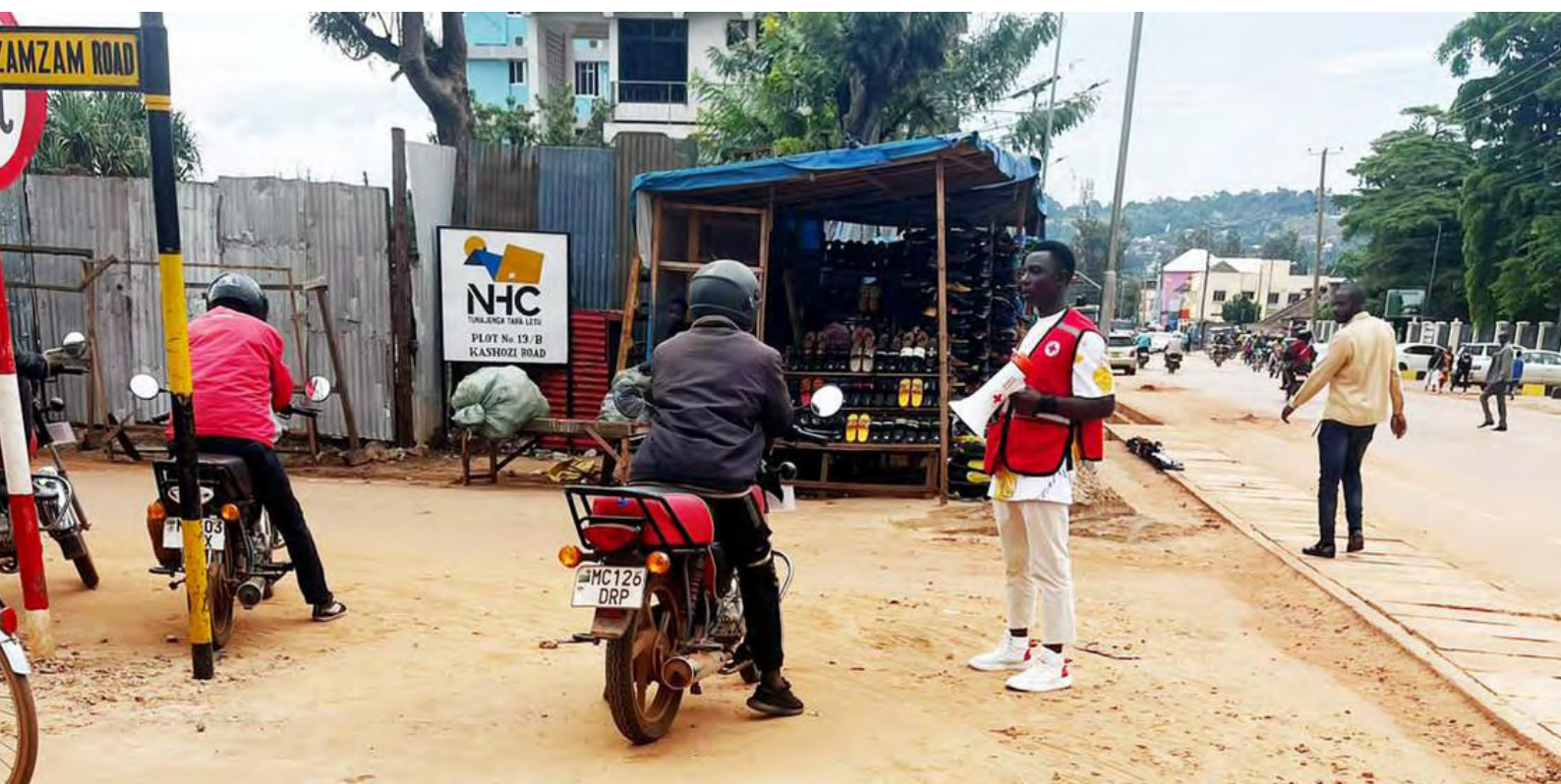
Tanzania Red Cross Society volunteer raising community awareness about epidemic disease prevention in Bukoka, 16 March 2023.