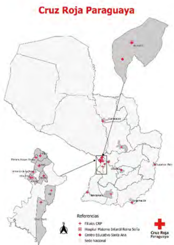
Map of the territorial units of the Paraguayan Red Cross

In its latest Strategic Plan (2021-2025) , the National Society aims to (a) enhance the impact of health, youth, social inclusion and disaster risk management programmes (b) develop a sustainable organizational culture (c) strengthen the institutional identity to generate a national positioning of reference, and (d) generate and implement financial sustainability strategies locally, nationally, and at the Reina Sofía Maternal and Children's Hospital.