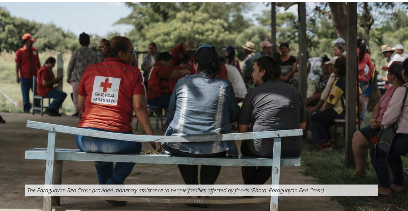
The Paraguayan Red Cross provided monetary assistance to people families affected by floods