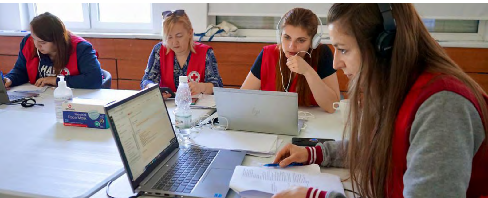
Specially trained Ukrainian refugees work in a call centre in Warsaw, Poland, run by the Polish Red Cross and the IFRC answering calls from other refugees and supporting them with information.

The Spanish Red Cross supports digital transformation of the National Society through training of staff in data and digital systems, and training-of-trainers to implement digitalization in branches.