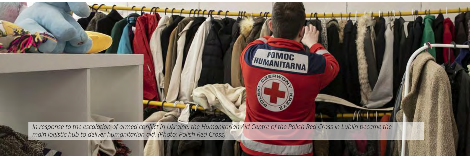
In response to the escalation of armed conflict in Ukraine, the Humanitarian Aid Centre of the Polish Red Cross in Lublin became the main logistic hub to deliver humanitarian aid.

The International Committee of the Red Cross (ICRC) supports Polish Red Cross with tracing services, mainly targeting the restoring family link services to migrants, including refugees.