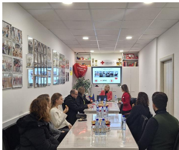
Field visit to the local Red Cross branch in Budva. Participants discussing various aspects of the branch's operations.