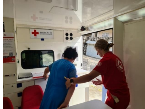
RCM Mobile Office supporting vulnerable people with AccessRC registration.