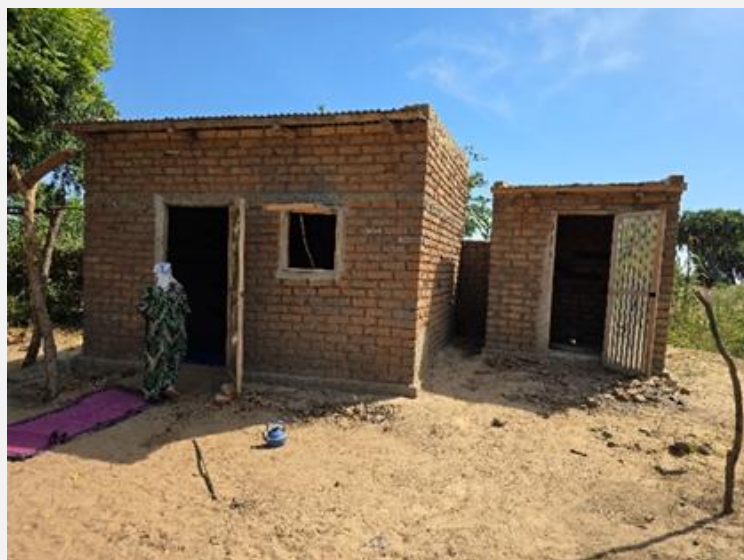
Figure 3: Semi-permanent shelters and latrines built for an elderly person who lost his or her home due to floods, Moudassi, Bongor (Mayo-Kebbi East province).

• Finally, in the shelter sector, the CRT assisted 2,767 households affected by the floods through a range of interventions. This includes the construction of 60 emergency Shelters, provision of cash assistance for housing rental to 982 people, construction of 125 semi-permanent shelters, and distribution of 1,600 shelter tool kits. These interventions helped address immediate shelter needs while supporting households in their recovery efforts.