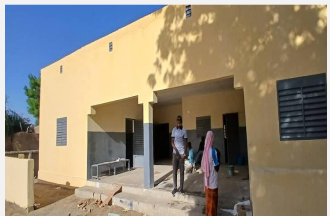
Figure 9: Front view of the Kournari Health Centre rehabilitated by the Red Cross of Chad