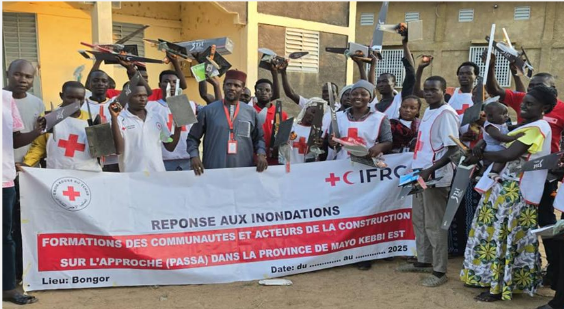
Figure 2: Participants at the training workshop on safe shelter construction techniques, according to the PASSA (Participatory Approach for Safe Shelter Awareness) approach, Bongor, Mayo-Kebbi East province.

In close collaboration with the administrative authorities and community leaders, distribution points were set up to facilitate access for affected households.