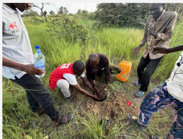
Figure 11: Reforestation operations in the province of Mayo Kebbi East in the presence of the Provincial Delegate of the Environment and members of the community