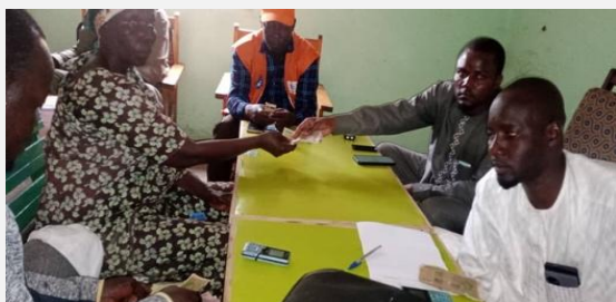
Figure 5: A beneficiary receiving cash from Moov Africa staff in Sarh