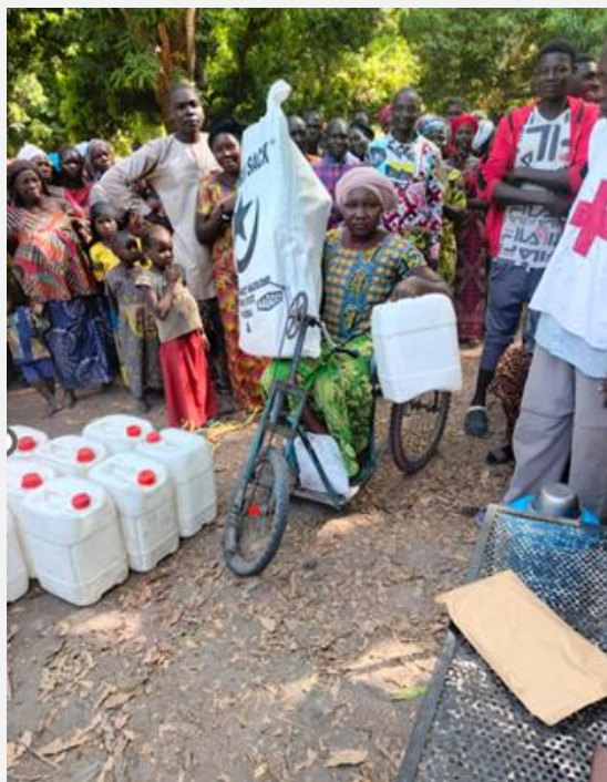
Figure 4: A person living with a disability happy to receive Essential Household Items (EHI) at the Bekondjo site, Logone Oriental Province.