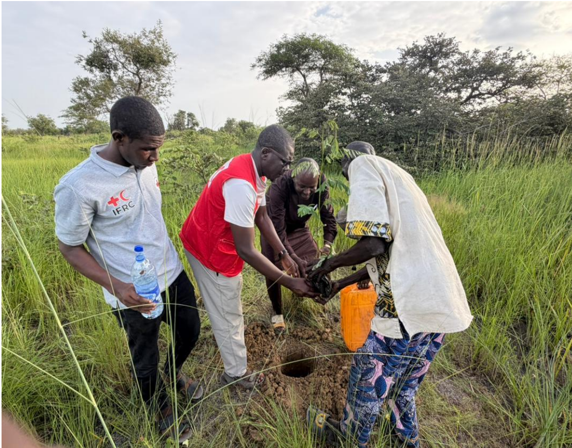
Photographic view of CRC volunteers during tree planting in Bongor, Mayo Kebbi East province.