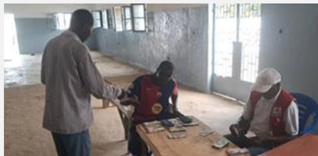
Figure 6: A beneficiary from Fianga, Mayo Kebbi East province, receiving cash in the presence of CRT staff