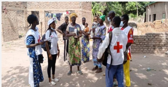
Figure 10: Awareness campaign on hygiene promotion by CRT volunteers in Doba