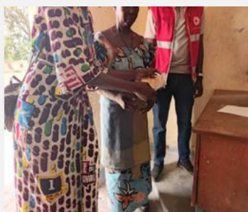
Figure 7: A beneficiary from Logone Oriental receiving cash