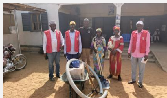
Figure 8: An agricultural group that received a motor pump and agricultural equipment to strengthen their agricultural activity in the Province of Logone Oriental.

During the Operation extension period, the following activities will be implemented: