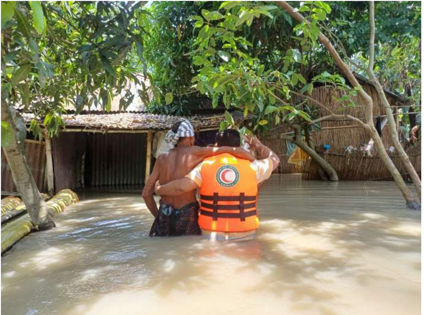
Bangladesh Red Crescent Society volunteers evacuating vulnerable people in Bogura district as part of the Flood Early Action Protocol.