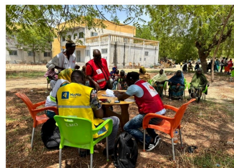
Figure 3: Cash distribution with FSP, CRC and IFRC