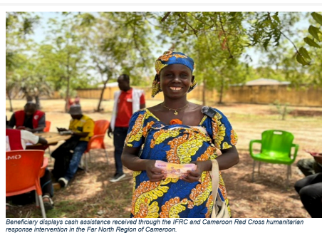
Beneficiary displays cash assistance received through the IFRC and Cameroon Red Cross humanitarian response intervention in the Far North Region of Cameroon.