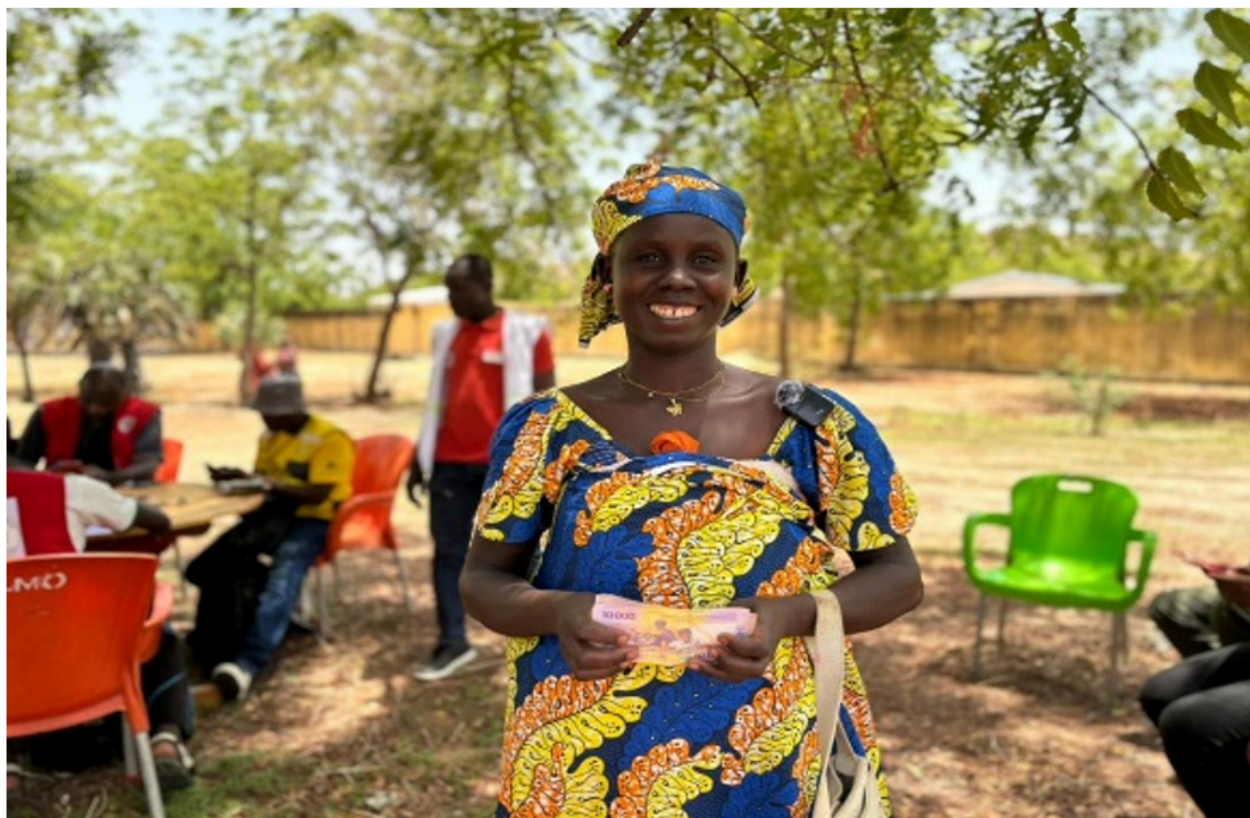
Beneficiary displays cash assistance received through the IFRC and Cameroon Red Cross humanitarian response intervention in the Far North Region of Cameroon.