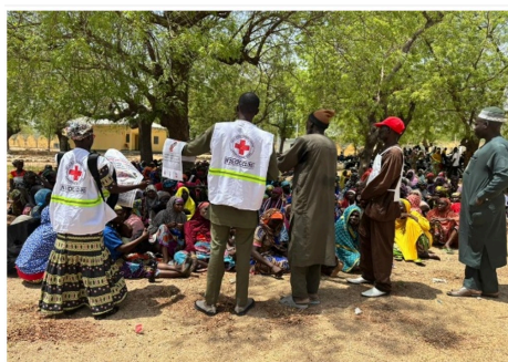
Figure 1: Community engagement with CRC volunteer on cash

The assessment results were shared with government authorities, humanitarian partners, and Movement stakeholders from 16 February 2026 onwards. Based on the evidence generated and subsequent consultations with key stakeholders, the IFRC approved the Emergency Appeal on 24 February 2026, and the appeal was officially launched on 26 February 2026 to support the rapid scale up of humanitarian assistance.