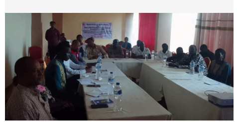
Volunteers training on PSS, PGI and CEA held in Mattar