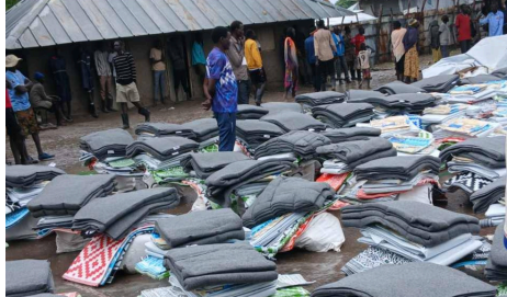
NFI distribution in Akobo Woreda, Gambella region