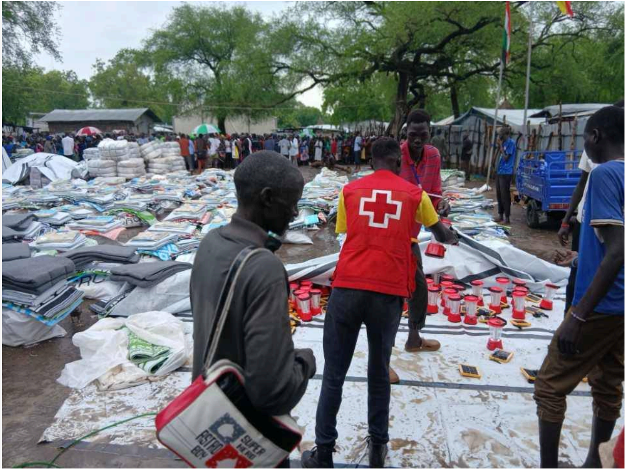
NFIs Distribution to S/Sudanese asylum seekers at Akobo, Gambella region