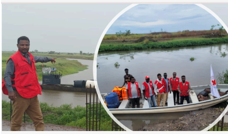
Assessment teams during security and needs assessment in Gambella region

forth continue, as asylum seekers attempt to access food assistance following recent WFP airdrops in Akobo State, South Sudan, despite a persistently high-risk security environment.