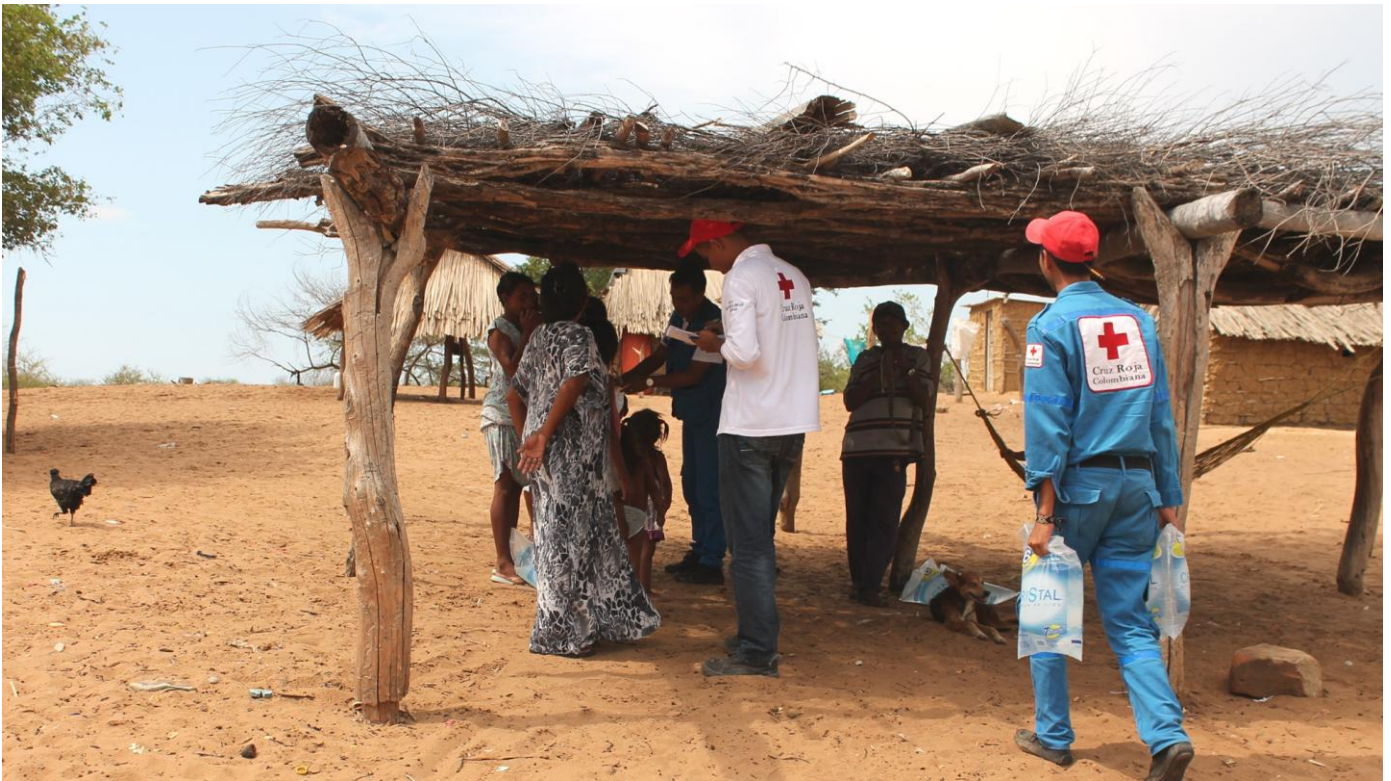
Delivery of drinking water by the Colombian Red Cross Society to communities in Alta Guajira, Colombia.