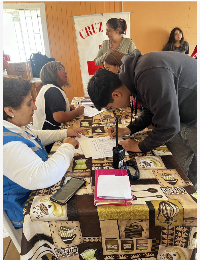
Distribution of Education kits, Chilean Red Cross. March 2026