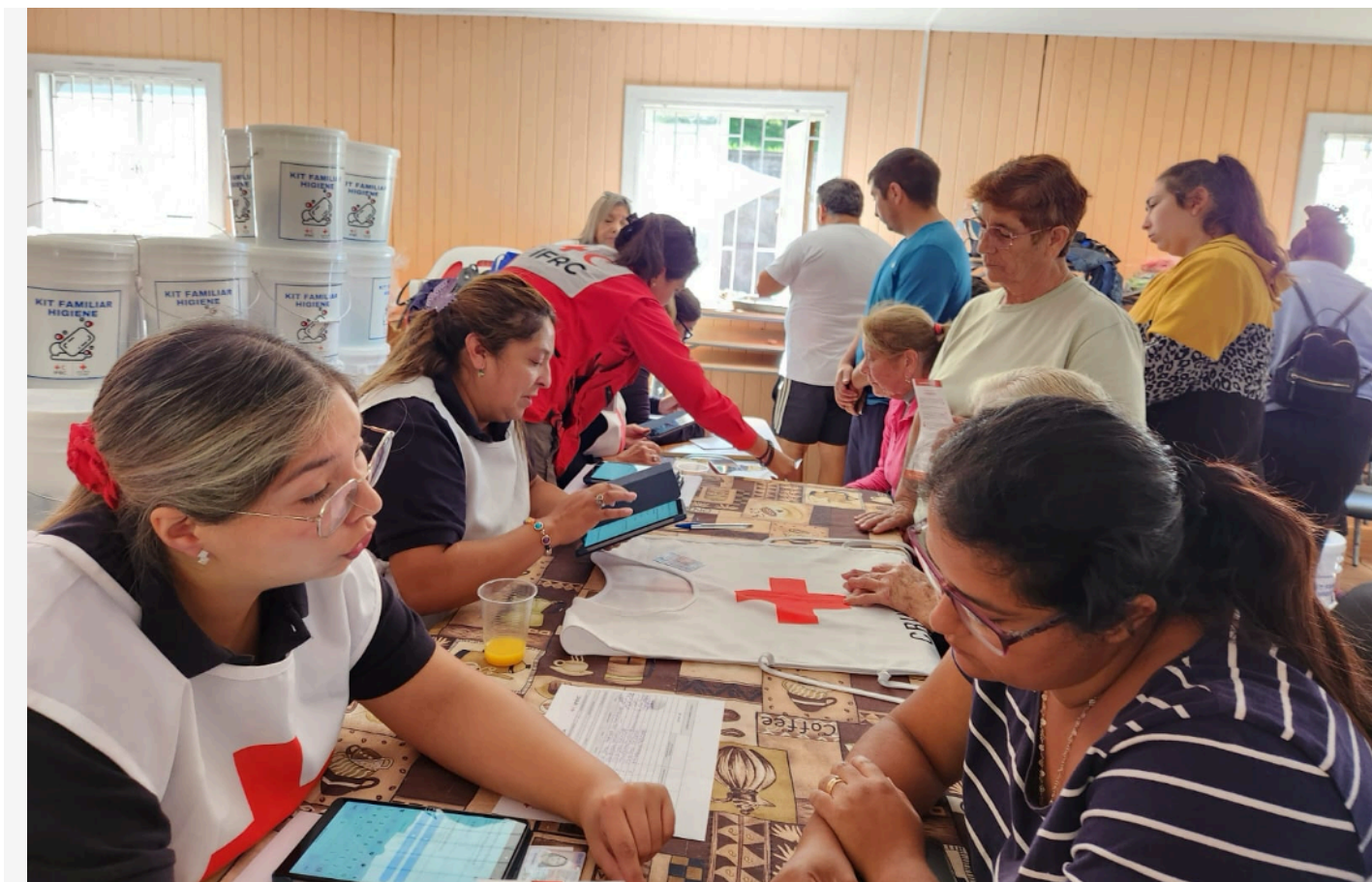
Distribution of hygiene kits in Tome. Chilean Red Cross. April 2026