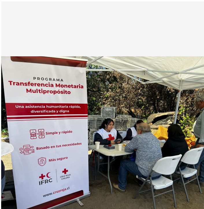
Distribution of Multipurpose Cash in Quillón. April 2026