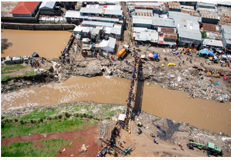
Aerial Assessment of flood effects in Nairobi