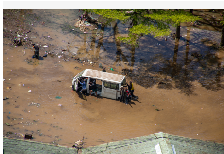
Affected area in Grogan, Nairobi