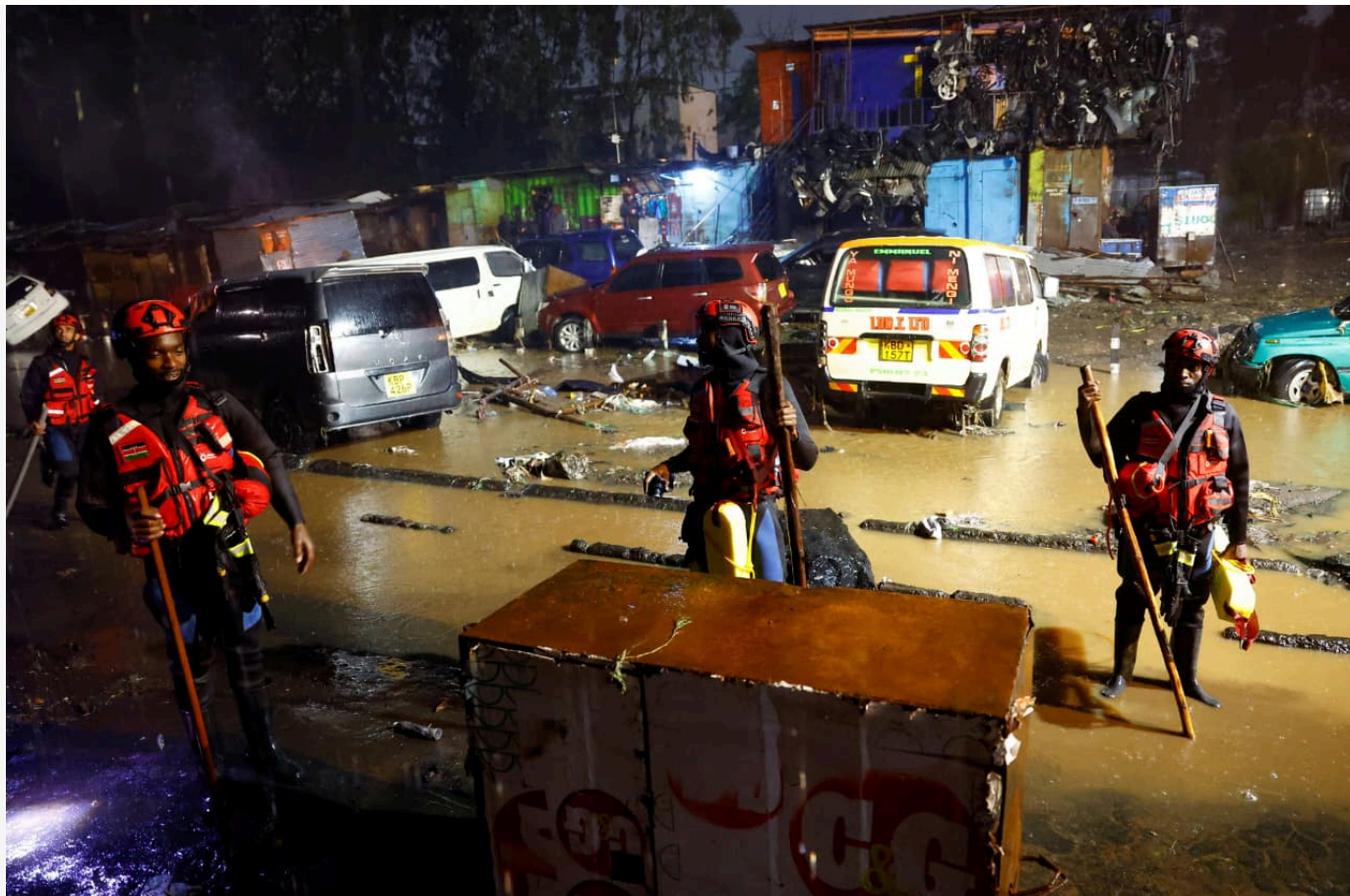
KRCS Aqua Team conducting Search and Rescue