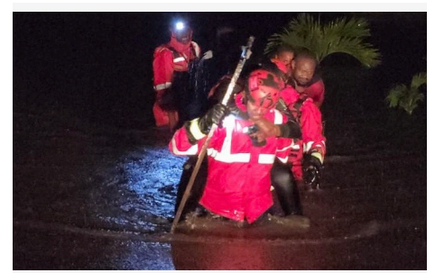
KRCS Conducting rescue operations in Nairobi