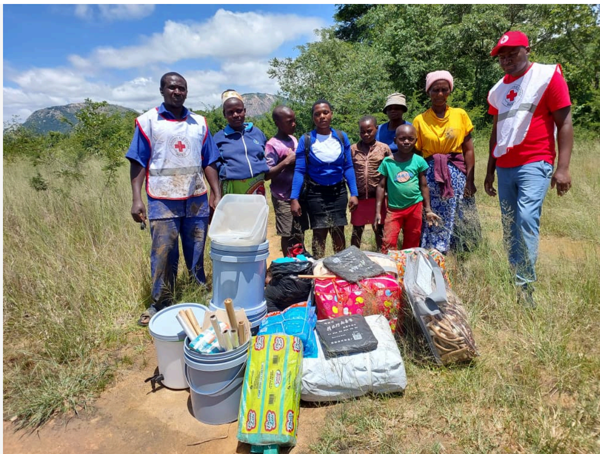
ZRCS Volunteers distributing NFIs to affected HHs in Mutare